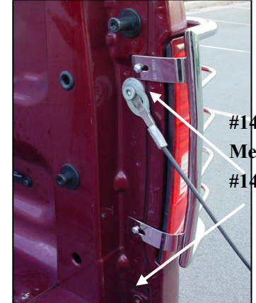
#14 x 1 ¼" Sheet Metal Screw, #14 Flat Washers