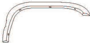
Right Front Flare