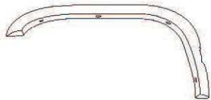
Left Front Flare