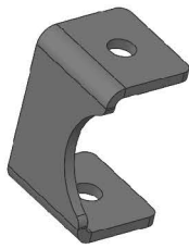
Back-Up Sensor Bracket