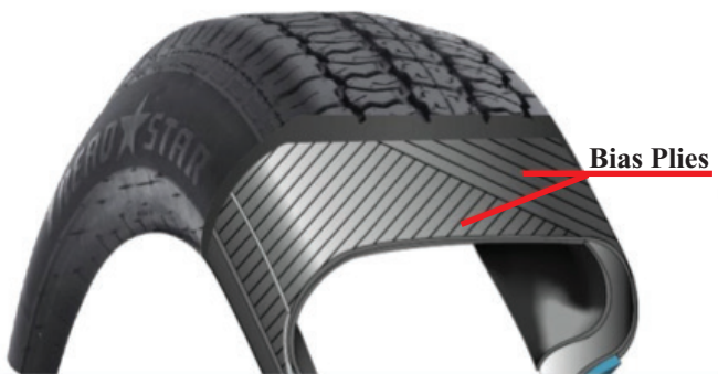
Bias Tire Construction