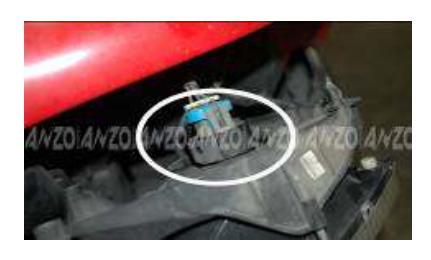
Remove the plug from the back of the stock headlight