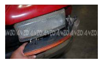
Slide the parking lamp out