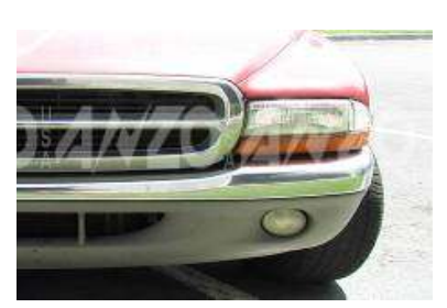
Tools needed Phillips screw driver 10mm socket and ratchet

Application: 97-04 Dodge Dakota, 98-03 Dodge Durango