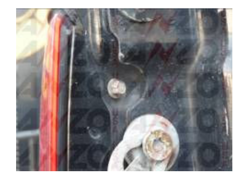
Step 2: Twist off the light bulb socket from the tail light.