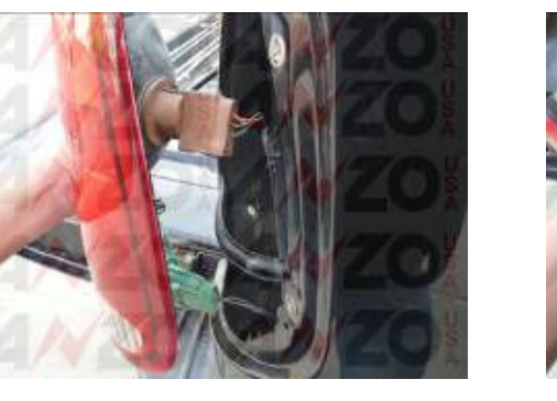
Step 3: Twist off the light bulb socket from the tail light.