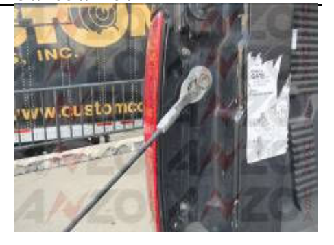
Step 1: Unscrew the two 8mm screw holding in the head light