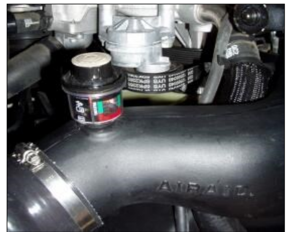
Optional: Installation of Factory Filter Minder in MIT Tube