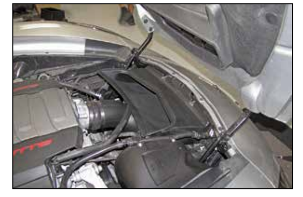
26. Reinstall the radiator heat extractor duct and secure with the factory hardware.