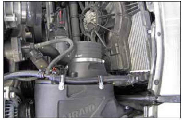
22. Install the provided straight coupler onto the AIRAID® mass air sensor and secure with the provided hose clamp.