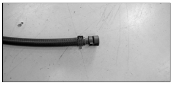
18. Install the provided quick disconnect fitting into one of the provided coolant hoses and secure with the provided spring clamp.