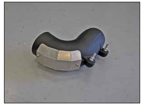
15. Install the provided heat shield onto the AIRAID® intake tube and secure with the provided hardware.