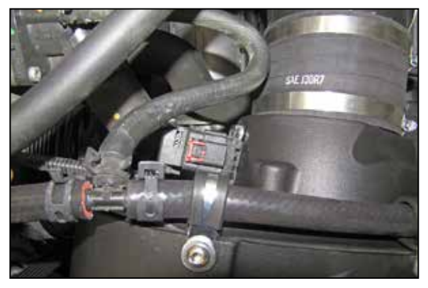
25. Reconnect the mass air sensor electrical connection.