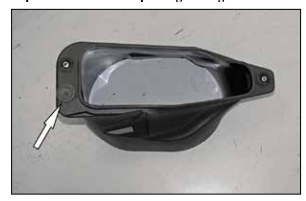
9. Transfer the factory air filter housing mounting grommet to the AIRAID® air filter housing in the location shown.

8. Insert the mounting grommets with sleeves into the AIRAID® air filter housing at the two locations shown. NOTE: The rubber grommets will be on both sides of the part with the sleeve passing through them.