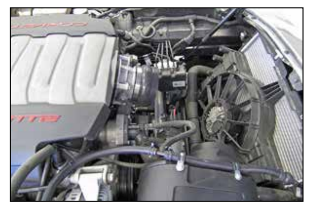
21. Install the provided hump coupler onto the throttle and secure with the provided hose clamp.