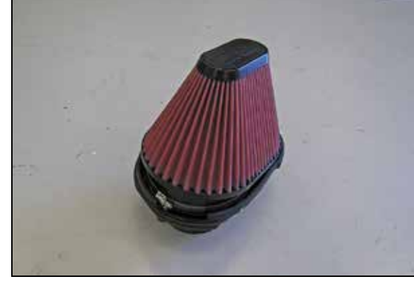
13. Install the AIRAID® air filter onto the AIRAID® mass air sensor assembly and secure with the provided hose clamp.

12. Remove the mass air sensor from the factory housing and then install it into the AIRAID® housing and secure with the provided hardware.