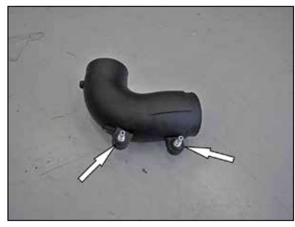
14. Install the provided grommets and crank case vent fittings into the AIRAID® intake tube as shown.