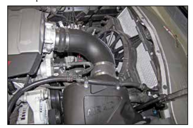
23. Install the AIRAID® intake tube into the straight coupler at the mass air sensor and then into the hump coupler at the throttle body, adjust the tube for best fit and then secure with the provided hose clamps.