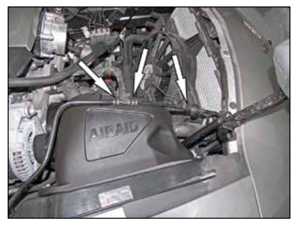
17. Be sure the vehicle is completely cool before beginning this step. Be sure to capture any coolant that leaks from the lines. Using a razor or sharp instrument, cut the nylon coolant lines in the three locations shown. Use multiple shallow cuts so as not to cut too deep and cause damage to the underlying fittings. Remove the nylon coolant lines from the check valve and tee fitting and expansion tank. The check valve should still be attached to the line attached to the radiator.