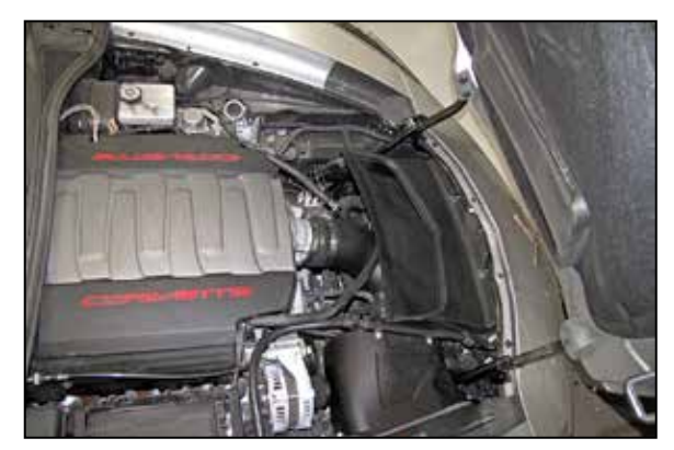
27. Double check your work! Make sure there is no foreign material in the intake path. Make sure all clamps, hoses, bolts, and screws are tight. Double check the hood clearance! Reconnect the negative battery cable!

Thank you for purchasing the Airaid Intake System. Contact Airaid @ (800) 498-6951 8:00 AM - 5:00 PM MST weekdays for questions regarding fit or instructions that are not clear to you. Your Airaid Intake System was carefully inspected and packaged. Check that no parts are missing, or were damaged during shipping. If any parts are missing, contact Airaid. The air filter element is protected from direct exposure to water and debris; care should be taken not to drive through deep water. WATER INGESTION IS THE DRIVERS RESPONSIBILITY! The air filter is reusable and should be cleaned periodically.