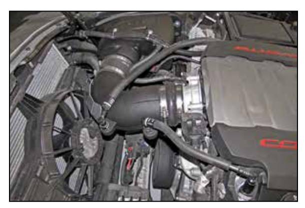
24. Connect the crank case vent hoses onto the fittings installed into the AIRAID® intake tube.