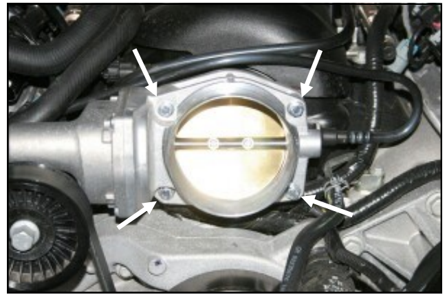
5. Install the provided bolts and washers thru the throttlebody, gasket, and Poweraid Spacer and tighten to the manufacturer's specifications.