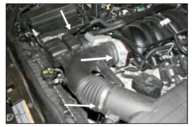
6. Reinstall the intake tube, tighten the two hose clamps, and reconnect the crankcase breather tube. Reinstall the beauty cover, and oil cap in the reverse order that they were removed. Re-connect the negative battery cable!