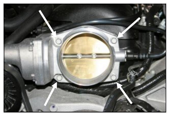
3. Remove the four bolts that secure the throttlebody to the intake manifold.