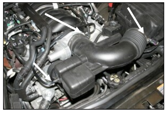
2. Disconnect the breather hose elbow by pulling it straight away from the intake tube. It is only held in place by an O-ring. Loosen the two hose clamps that secure the intake tube to the throttlebody, and the air box lid. Remove the air intake tube.

1. <u>Disconnect the negative battery cable!</u> Remove the oil fill cap and set it aside. Lift straight up on the engine beauty cover and set it aside. Reinstall the oil fill cap after the beauty cover has been removed to prevent any foreign material from entering the crankcase.