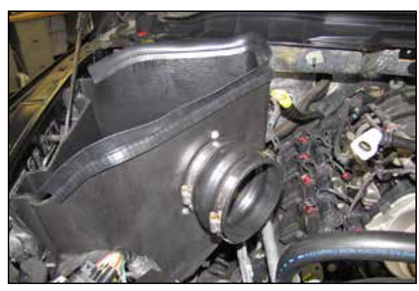
14. Install the provided hump coupler onto the filter adapter as shown.