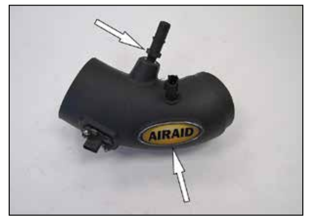
12. Install the provided quick connect vent fitting and AIRAID decal onto the AIRAID intake tube as shown. NOTE: Plastic NPT fittings are easy to cross thread. Install the vent fitting "hand" tight, then turn it two complete turns with a wrench.