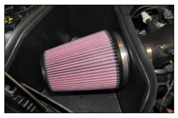
17. Install the air filter onto the filter adapter and secure with the provided hardware.