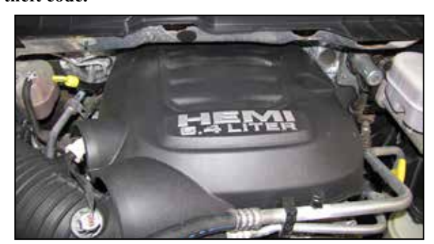
2. Lift the decorative engine cover up and remove it from the vehicle.

NOTE: Disconnecting the negative battery cable erases pre-programmed electronic memories. Write down all memory settings before disconnecting the negative battery cable. Some radios will require an anti-theft code to be entered after the battery is reconnected. The anti-theft code is typically supplied with your owner's manual. In the event your vehicles anti-theft code cannot be recovered, contact an authorized dealership to obtain your vehicles anti-theft code.