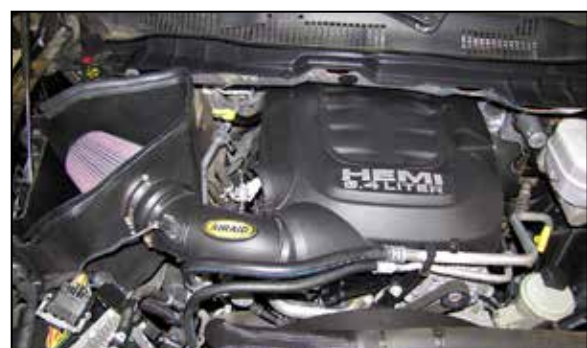
19. Double check your work!

Make sure there is no foreign material in the intake path. Make sure all clamps, hoses, bolts, and screws are tight. Double check the hood clearance!