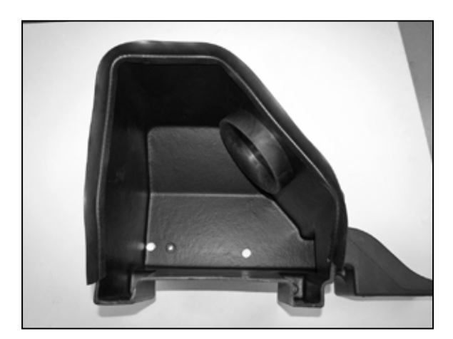
9. Install the provided wiper trim onto the AIRAID filter housing as shown.