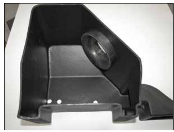
7. Install the filter adapter into the air box as shown and secure with the provided hardware.