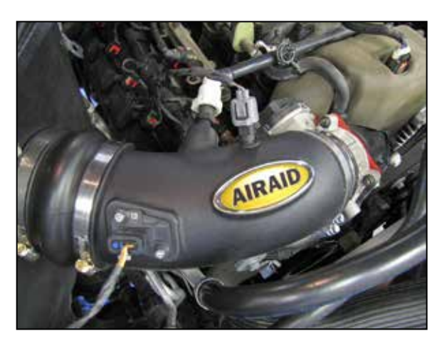
16. Connect the crank case vent to the fitting installed into the AIRAID intake tube. Reconnect the mass air sensor and inlet air temperature sensor electrical connections.