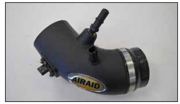
13. Install the provided step coupler onto the AIRAID intake tube as shown.