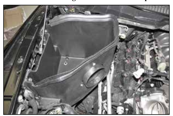
10. Install the AIRAID filter housing onto the factory air filter housing mounting studs and secure with the hardware provided.