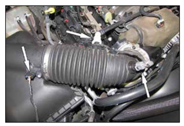
3. Disconnect the mass air sensor and inlet air temperature sensor electrical connections and disconnect the crank case vent quick connect fitting.