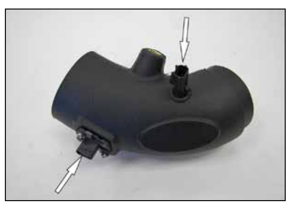
11. Remove the mass air sensor and inlet air temperature sensor from the factory air filter housing and install them into the AIRAID intake tube with the provided hardware and grommet.