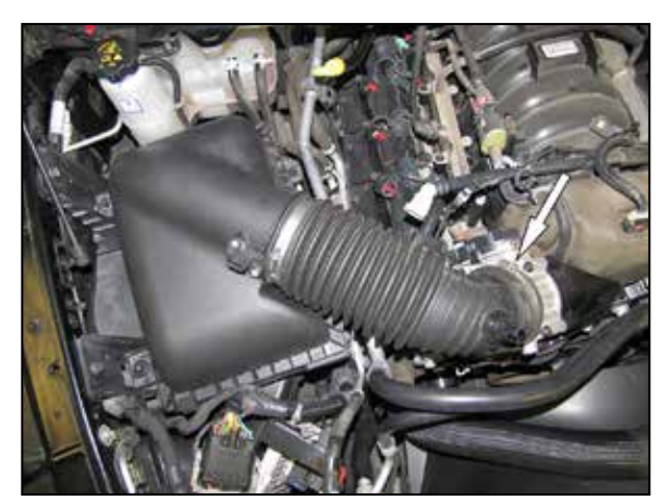
4. Loosen the hose clamp that secures the factory intake tube to the throttle body, release the four clips that secure the upper air filter housing and then remove the upper air filter housing and intake tube from the vehicle.