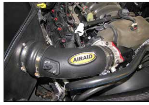
15. Install the AIRAID intake tube into the hump coupler and onto the throttle body, adjust the tube and couplers for best fit and then secure with the provided hose clamps.