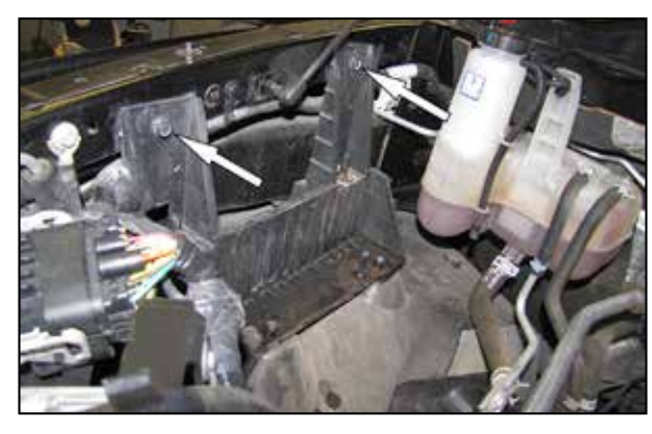
6. Remove the two upper filter housing bracket mounting bolts.

NOTE: Airaid recommends that customers do not discard factory air intake.