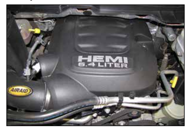
18. Reinstall the decorative engine cover.