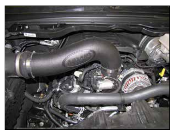
10. Install the AIRAID® intake tube into the coupler at the air filter housing and then into the coupler at the throttle body, adjust the tube for best fit and then secure with the provided hose clamps.

NOTE: Plastic NPT fittings are easy to cross thread. Install the vent fitting "hand" tight, then turn it two complete turns with a wrench.