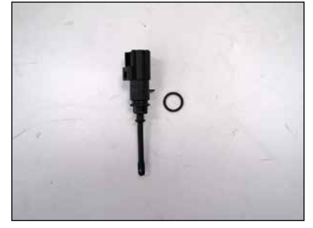
8. Remove the Inlet air temperature sensor from the factory intake tube and then remove O-ring from the sensor.

NOTE: The Inlet air Temperature sensor is very fragile.