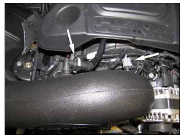
11. Reconnect the inlet air temperature sensor electrical connection and crank case vent line.