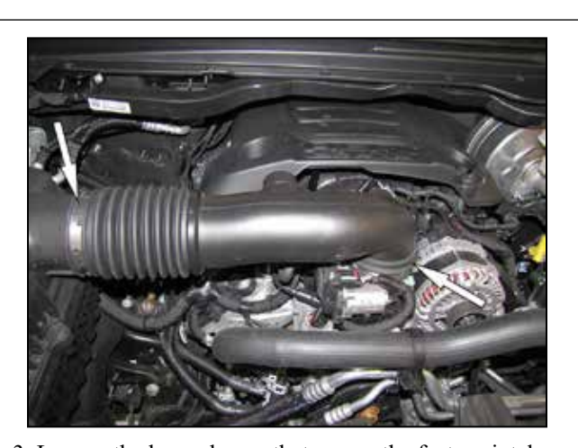
3. Loosen the hose clamps that secure the factory intake tube and then remove the intake tube from the vehicle.