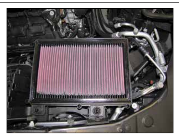
5. Install the AIRAID<sup>®</sup> air filter and then replace the factory lid and secure with the factory screws.

2. Disconnect the crank case vent line from the factory intake tube and disconnect the inlet air temperature sensor electrical connection.