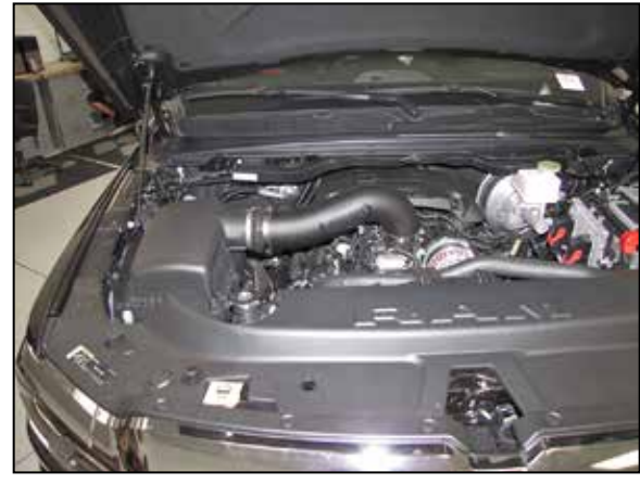
12. Double check your work! Make sure there is no foreign material in the intake path. Make sure all clamps, hoses, bolts, and screws are tight. Double check the hood clearance! Reconnect the negative battery cable!

Thank you for purchasing the Airaid Intake System. Contact Airaid @ (800) 498-6951 8:00 AM - 5:00 PM MST weekdays for questions regarding fit or instructions that are not clear to you. Your Airaid Intake System was carefully inspected and packaged. Check that no parts are missing, or were damaged during shipping. If any parts are missing, contact Airaid. The air filter element is protected from direct exposure to water and debris; care should be taken not to drive through deep water. WATER INGESTION IS THE DRIVERS RESPONSIBILITY! The air filter is reusable and should be cleaned periodically.