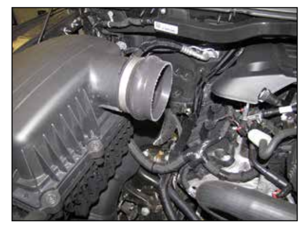
7. Install the provided hump coupler (KITHUMPHS35) onto the air filter housing and secure with the provided hose clamp.