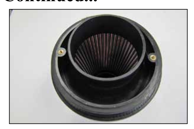
8. Install the radius adapter into the air filter as shown and secure with the provided hose clamp.