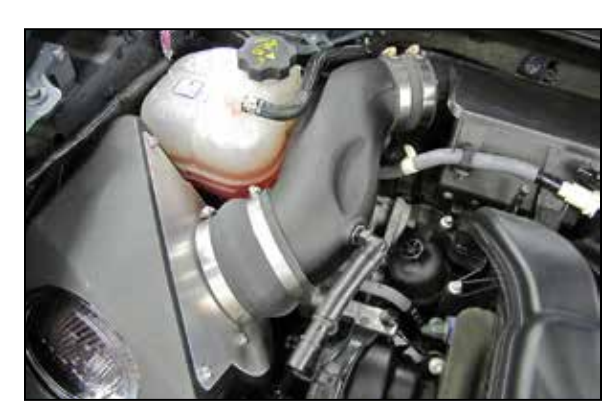
17. Install the intake tube assembly into the coupling hoses, adjust for best fit and then secure with the provided hose clamps.

NOTE: Plastic NPT fittings are easy to cross thread. Install the vent fitting "hand" tight, then turn it two complete turns with a wrench.