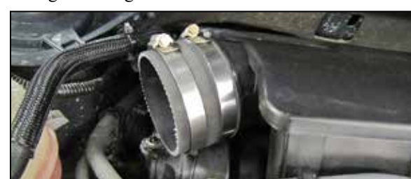
13. Install the provided coupler hose (08690) onto the intake plenum and secure with the provided hose clamps