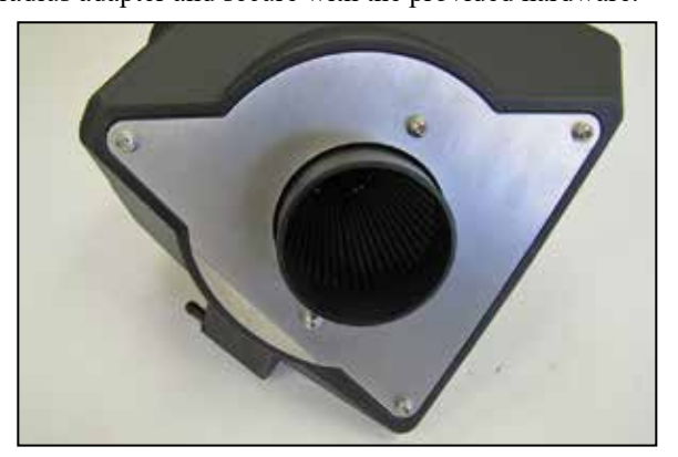
10. Install the air filter assembly into the air filter housing and secure with the provided hardware.