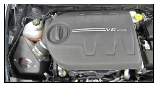
19. Reinstall the decorative engine cover. NOTE: It may be necessary to adjust the intake tube for clearance with the engine cover.