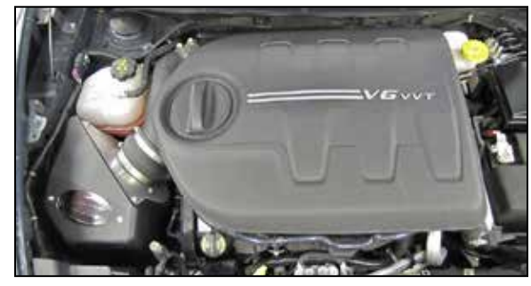
20. Double check your work!

Make sure there is no foreign material in the intake path. Make sure all clamps, hoses, bolts, and screws are tight. Double check the hood clearance!