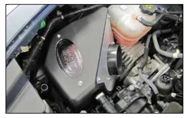
12. Install the AIRAID air filter housing assembly into the vehicle as shown so that it secures onto the factory housing mounting locations.