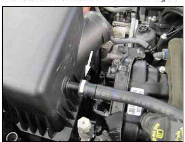
4. Disconnect the crank case quick connect fitting from the factory air filter housing. Pull up firmly on the air filter housing and remove it from the vehicle.

NOTE: AIRAID recommends that customers do not discard factory air intake.