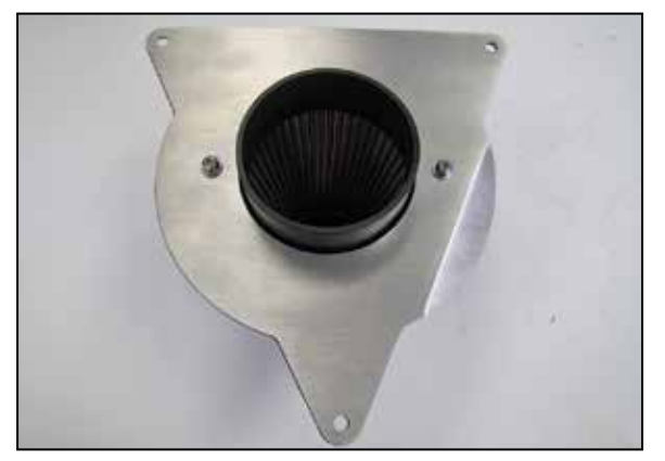
9. Install the air filter housing gasket and lid onto the radius adapter and secure with the provided hardware.