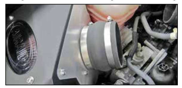
14. Install the provided coupler hose (08418) onto the filter adapter and secure with the provided hose clamp.