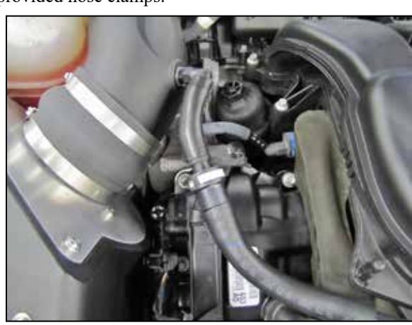
18. Connect the factory crank case quick connect fitting to the quick connect fitting installed onto the AIRAID intake tube.