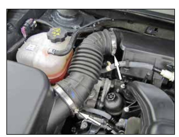
3. Loosen the hose clamps that secure the factory intake tube and then remove the intake tube from the engine.