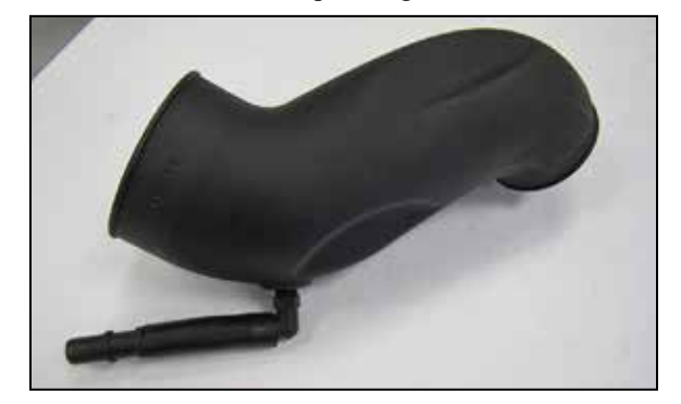
16. Install the assembled crank case hose assembly onto the AIRAID intake tube as shown.

NOTE: Plastic NPT fittings are easy to cross thread. Install the vent fitting "hand" tight, then turn it two complete turns with a wrench.