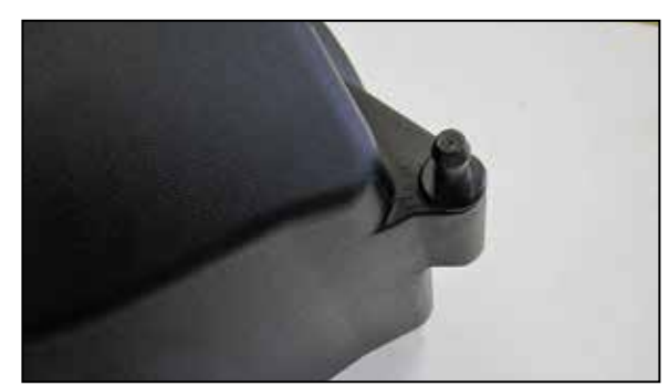
7. Install the air filter mount into the air filter housing as shown.