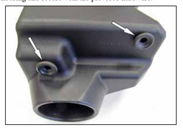
11. Remove the two mounting grommets from the factory air filter housing and install them into the AIRAID air filter housing as shown.