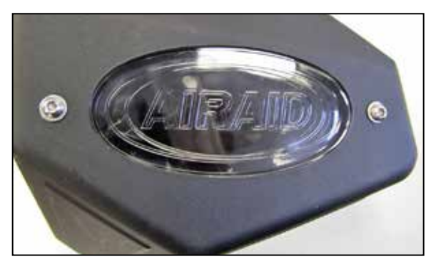
5. Install the AIRAID window into the AIRAID air filter housing using the provided hardware.

NOTE: AIRAID recommends that customers do not discard factory air intake.