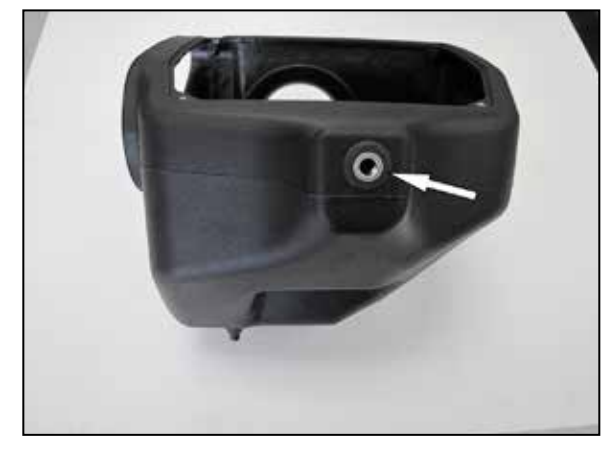
7. Install the provided grommet and support into the AIRAID air filter housing as shown.