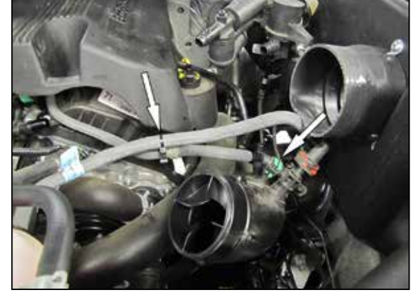
11. Disconnect the green EVAP connector and unhook the line from the retaining clip.

16. Install the coupler hose onto the filter adapter and secure with the provided hose clamp.