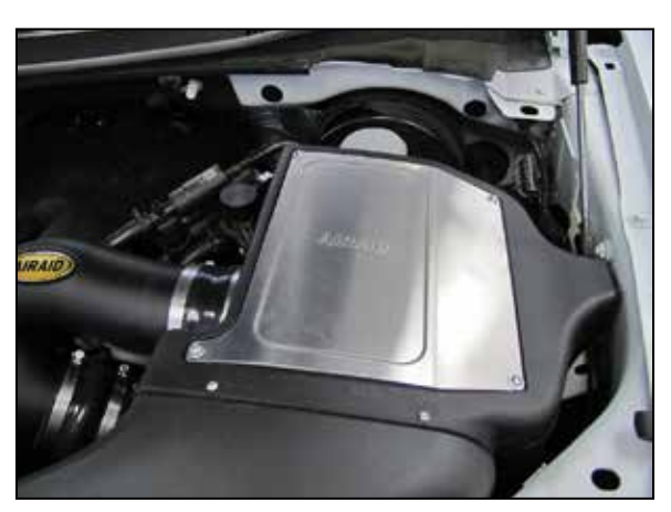
25. Install the air filter housing lid and secure with the provided hardware.