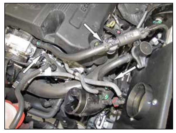
15. Install the modified crank hoses onto the solenoid valves and turbo intake tubes.