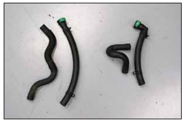
14. Remove the fittings from the factory crank case vent hoses in step #10 and install them into the 8" and 12-1/2" long hoses as shown.