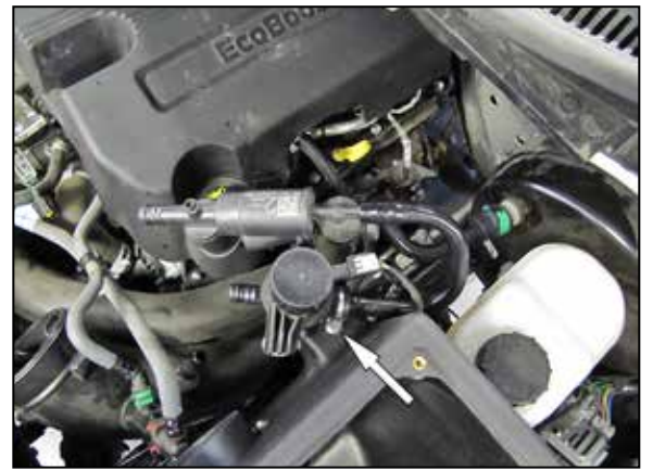
10. Remove the two crank case vent hoses from the solenoid valves and turbo inlet tubes and set aside. Using the provided clamp, secure the solenoid pack to the AIRAID air filter housing. Rotate the brake booster hose where it attaches to the solenoid pack so the it lines up with the brake booster and does not cause a bind.