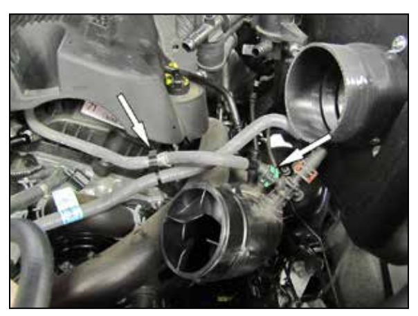
12. Route the line in front of the red EVAP line and reconnect to the fitting. Resecure the line retaining clip.