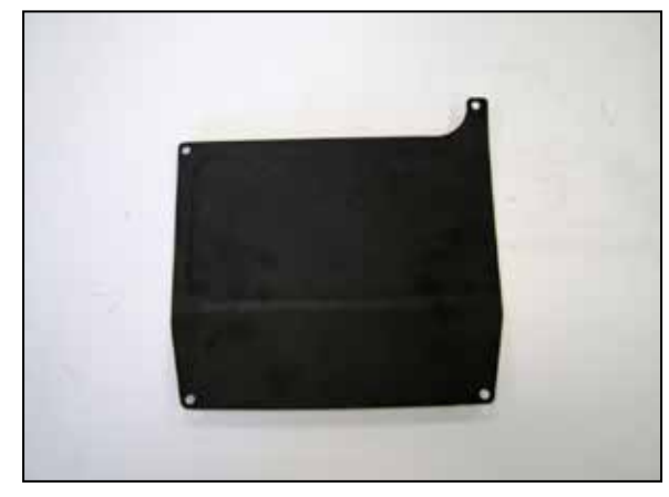
24. Install the provided gasket onto the air filter housing lid.