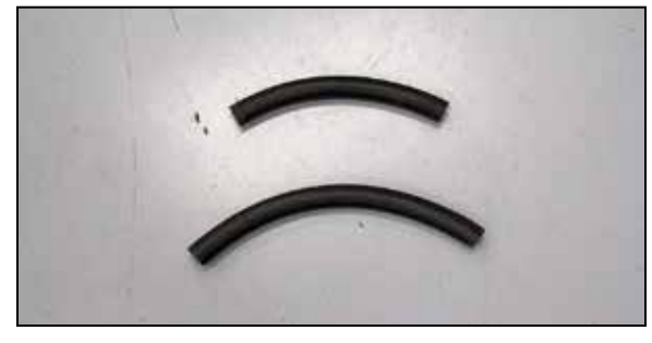
13. Cut the provided hose into two sections, one will be 8"long and the other will be 12-1/2" long.