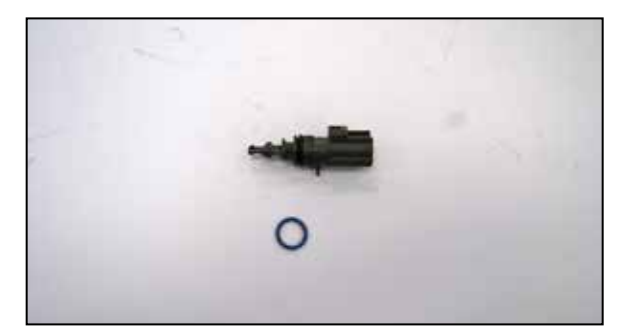
18. Remove the inlet air temperature sensor from the factory air filter housing and then remove the factory O-ring. Install the provided O-ring onto the inlet air temperature sensor.