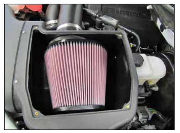
23. Install the AIRAID air filter onto the adapter and secure with the provided hose clamp.