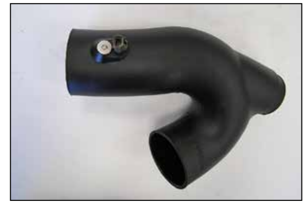
19. Install the inlet air temperature sensor into the AIRAID intake tube and then secure with the provided hardware.