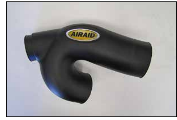
20. Install the AIRAID logo onto the intake tube.