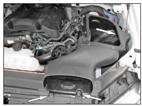
9. Install the AIRAID air filter assembly into the vehicle and secure it to the inner fender and core support with the hardware and retaining clips provided.