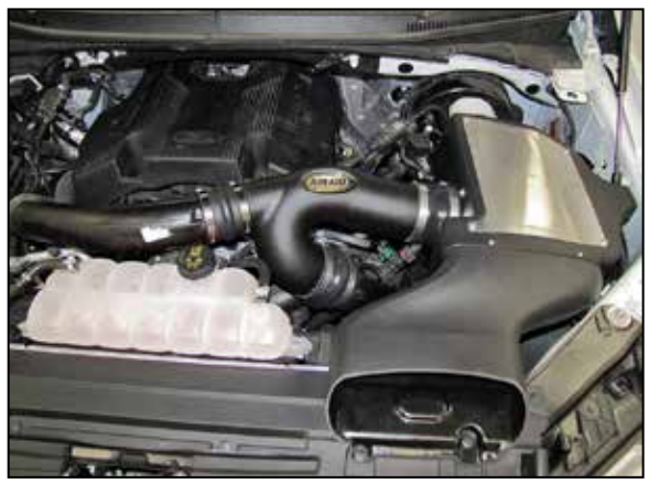
26. Double check your work! Make sure there is no foreign material in the intake path. Make sure all clamps, hoses, bolts, and screws are tight. Double check the hood clearance! Reconnect the negative battery cable!

Thank you for purchasing the Airaid Intake System. Contact Airaid @ (800) 498-6951 8:00 AM - 5:00 PM MST weekdays for questions regarding fit or instructions that are not clear to you. Your Airaid Intake System was carefully inspected and packaged. Check that no parts are missing, or were damaged during shipping. If any parts are missing, contact Airaid. The air filter element is protected from direct exposure to water and debris; care should be taken not to drive through deep water. WATER INGESTION IS THE DRIVERS RESPONSIBILITY! The air filter is reusable and should be cleaned periodically.