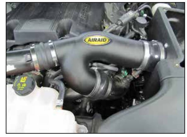
21. Install the intake tube into the turbo hose couplers and the coupler at the filter adapter. Adjust the tube for best fit and secure with the provided hose clamps.