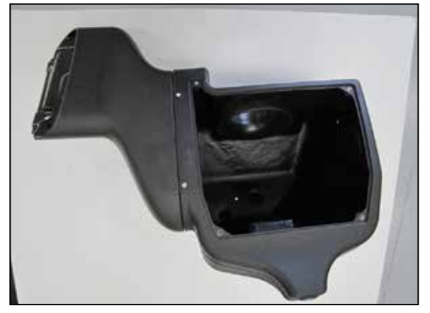
8. Install the AIRAID fresh air intake into the AIRAID air filter housing and secure with the provided hardware.