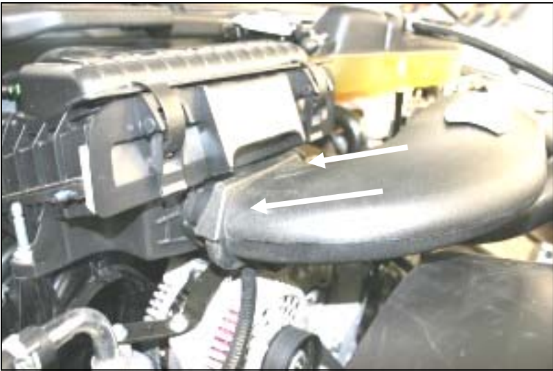
7. Install the Airaid Modular Intake Tube (#2) into the factory airbox. It will “snap” into place.