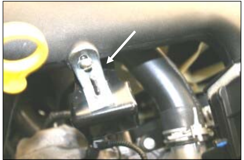
8. Install the L-bracket (#3) over the factory stud re-using the nut removed in step #1. Next install the button head bolt (#4) and washer (#5) thru the L-bracket, and into the tube. Leave loose until final adjustments have been made.