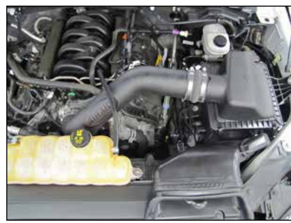
10. Double check your work! Make sure there is no foreign material in the intake path. Make sure all clamps, hoses, bolts, and screws are tight. Double check the hood clearance! Reconnect the negative battery cable!

Thank you for purchasing the Airaid Intake System. Contact Airaid @ (800) 498-6951 8:00 AM - 5:00 PM MST weekdays for questions regarding fit or instructions that are not clear to you. Your Airaid Intake System was carefully inspected and packaged. Check that no parts are missing, or were damaged during shipping. If any parts are missing, contact Airaid. The air filter element is protected from direct exposure to water and debris; care should be taken not to drive through deep water. WATER INGESTION IS THE DRIVERS RESPONSIBILITY! The air filter is reusable and should be cleaned periodically.