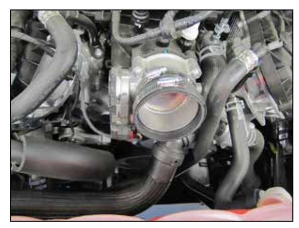
7. Install the provided coupler hose (08615) onto the throttle body and secure with the provided hose clamp.