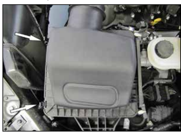
4. Release the two clips that secure the upper air filter housing and then remove the upper housing and factory air filter.

NOTE: AIRAID recommends that customers do not discard factory air intake.