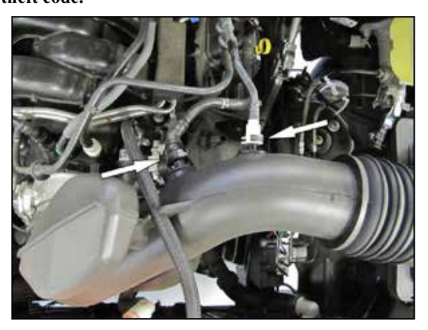
2. Disconnect the EVAP and crank case vent quick disconnect fittings.

NOTE: Disconnecting the negative battery cable erases pre-programmed electronic memories. Write down all memory settings before disconnecting the negative battery cable. Some radios will require an anti-theft code to be entered after the battery is reconnected. The anti-theft code is typically supplied with your owner's manual. In the event your vehicles anti-theft code cannot be recovered, contact an authorized dealership to obtain your vehicles anti-