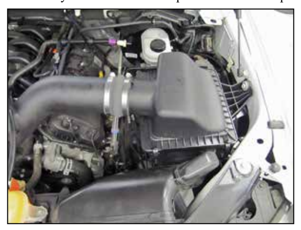
8. Install the AIRAID® intake tube into the coupler at the air filter housing and then into the coupler at the throttle body, adjust the tube for best fit and then secure with the provided hose clamps.