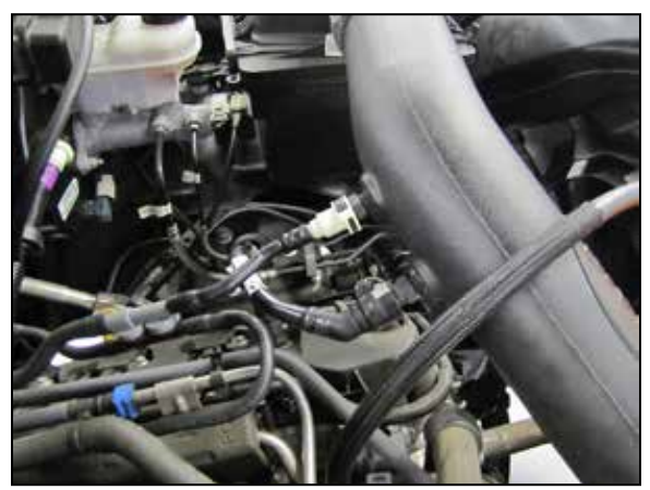
9. Connect the EVAP and crank case vent lines to the quick connect fittings installed into the AIRAID® intake tube.