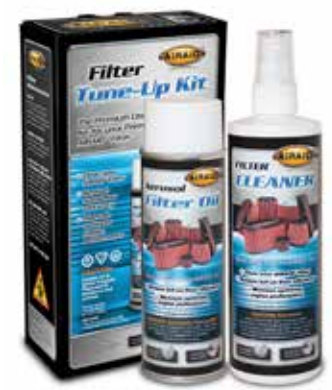
P/N 790-551 Aerosol Spray P/N 790-550 Squeeze Spray