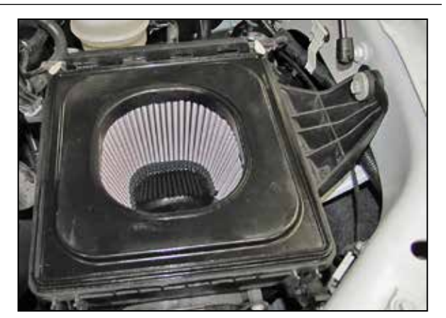
5. Install the provided AIRAID® air filter and reinstall the factory upper air filter housing.