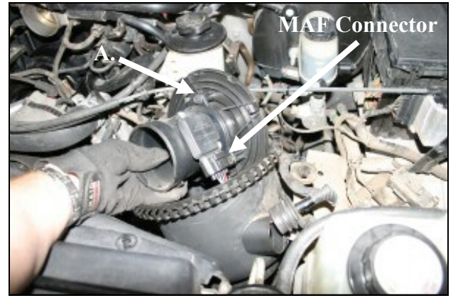
4.Unlatch the clamp on the canister to separate the two halves. Once separated, remove the factory air filter.A) Next, slide the large round plastic Mass Air Flow (MAE) sensor adapter plate from the canister. To do