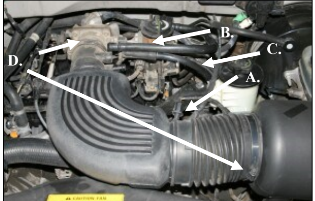
2. A) <u>Very carefully</u>, using a pulling circular motion, remove the air intake temperature sensor from the air intake tube. B) Disconnect the upper hard plastic tube from the air intake tube. C) Disconnect the crankcase breather at the intake tube and the valve cover, and remove it from the vehicle. D) Loosen two hose clamps and remove the air intake tube from the vehicle.