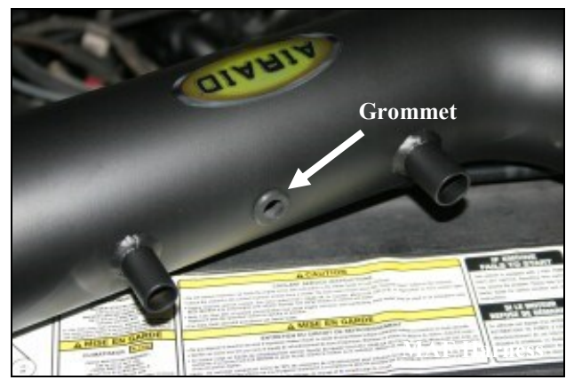
13. Install the supplied rubber grommet (#24) into the Airaid Intake Tube (#2) as shown.