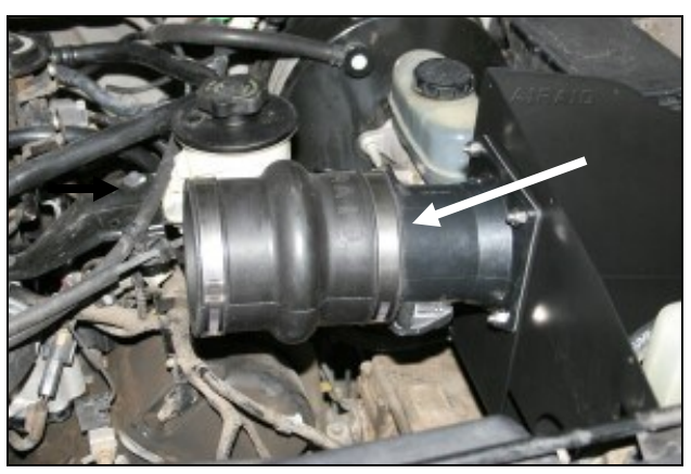
11. Install the hump hose (#7) onto the MAF sensor housing as shown using two #60 hose clamps (#21). Tighten only the clamp on the MAF sensor housing at this time.