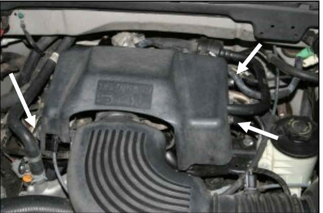
1. Disconnect the negative battery cable. Using a 10mm socket, remove the three bolts that secure the beauty cover over the throttlebody. Remove the cover and save these parts for reinstallation in step #16.