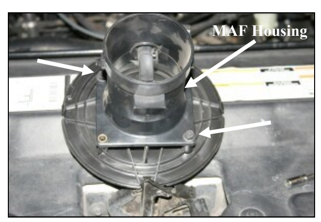
5. Remove the bolts that secure the MAF sensor housing to the adapter. Separate the adapter plate from the MAF sensor housing and save the sensor and housing for reinstellation in step #7