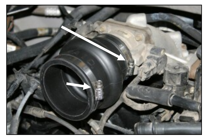
12. Install the small end of the reducing hump hose (#8) onto the throttlebody and tighten the #52 hose clamp (#20). Next, install the remaining #60 hose clamp (#21) on the large end of the hump hose leaving it loose for now.