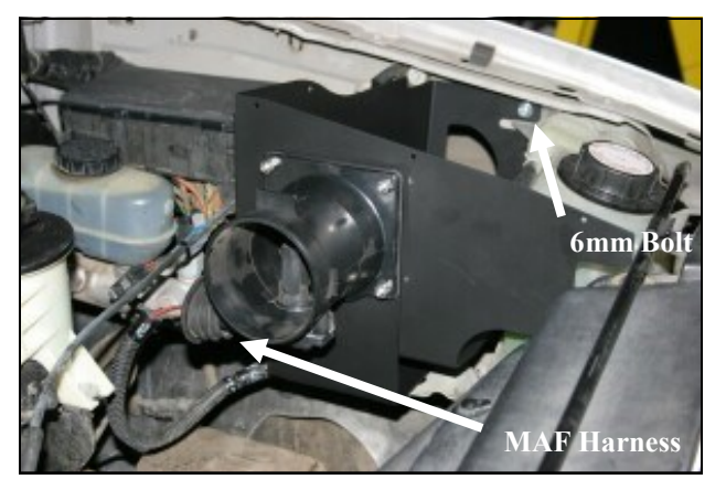
10. Install the CAD assembly into the vehicle using two 1/4-20x7/8" bolts (#15), four 1/4" flat washers (#16), one MAF backing plate (#19), and two 1/4" nylock nuts (#17). Leave the two bolts slightly loose for now for final adjustment. Refer to the line drawing on page 1 for reference. Next, reinstall the 6mm bolt thru the CAD, radiator overflow tank, and into the fender well. Reconnect the MAF sensor wiring harness.