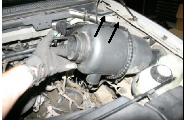
3. Lift straight up on the outlet side of the air filter canister to remove it from it's locating grommets. Next, pull it towards the engine to dislodge it from the inner fender well.