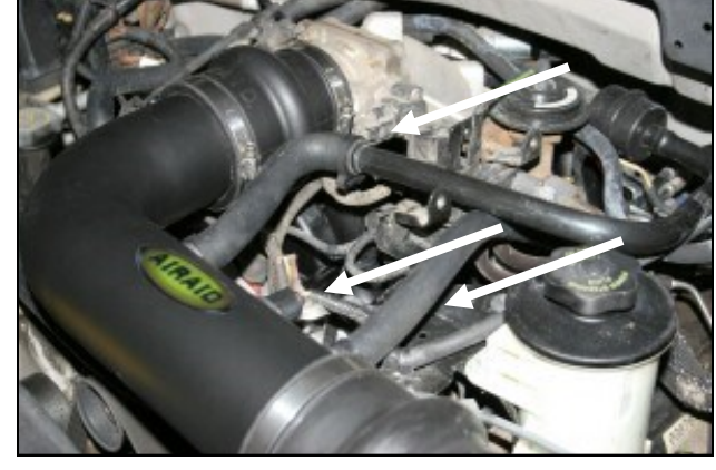
14. Install the Airaid Intake Tube into the hump hose on the MAF, and then into the hump hose on the throttlebody. Adjust for fit, and then tighten the hose clamps. Connect the 5/8"x18" breather hose (#9) between the valve cover and the intake tube as shown using two #19 speed clamps (#22). Now carefully reinstall the intake air temperature sensor into the grommet from step #13. Now that everything is in place, tighten the three bolts that secure the CAD to the vehicle. 5.4L engines: Measure, and then cut the 3/4"x12" L-hose (#10) and then install it between the hard plastic hose and the intake tube as shown using two #22 speed clamps (#23).