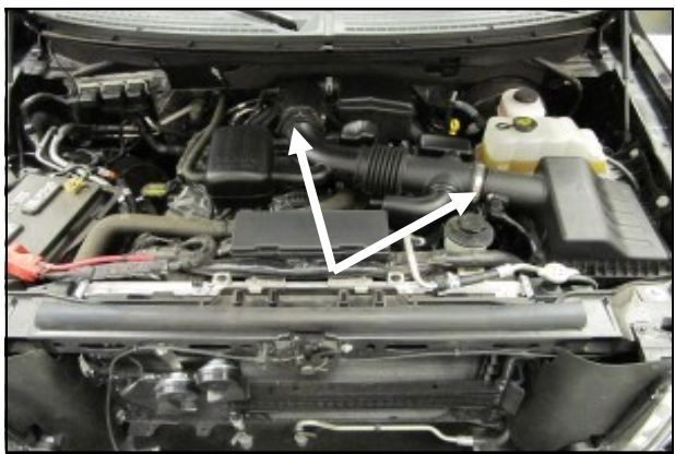
1. Disconnect the negative battery cable! Loosen the two intake clamps and remove the Factory intake tube.