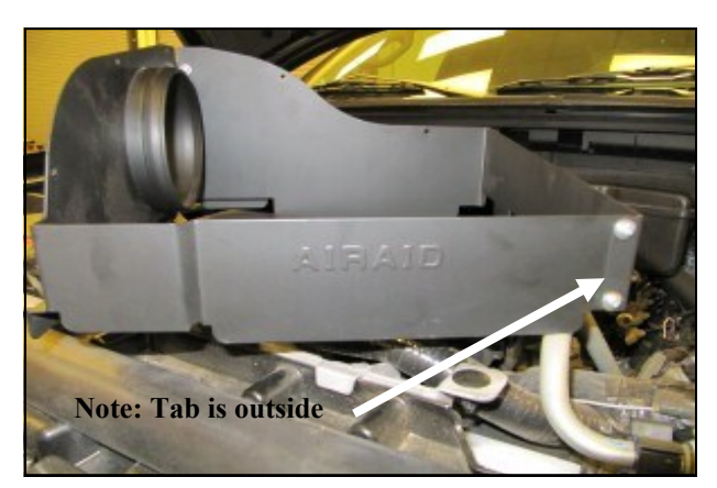
4. Assemble the two Quick Fit panels (#3 & #4) as shown using four 6-32 screws (#9) flat washers (#11) and kep nuts (#10).