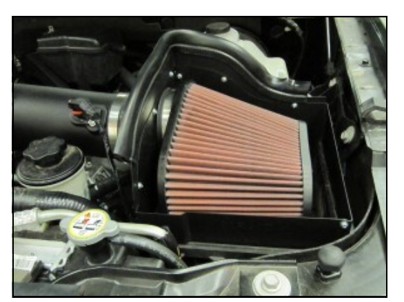
10. Install the Airaid Premium Filter (#1) to the mounting flange inside the quick fit assembly. Complete the installation by attaching the Weather Strip (#5) to the top of the panels as shown.