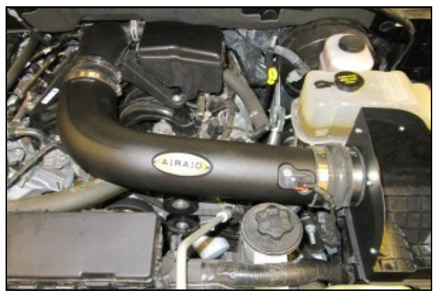
9. A.) Insert the Airaid Intake Tube into the couplers as shown. Check for alignment, and tighten all clamps.B.) Re connect the Mass Air Flow Sensor.