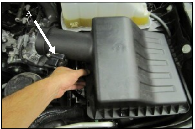
2. A.) Disconnect the Mass Air Flow (MAF) Sensor.

B.) Unfasten the three airbox clips on the left side, and remove the upper half of the factory airbox.