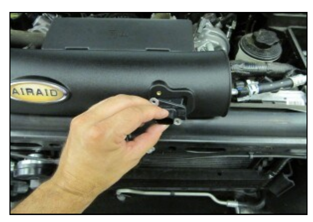
8. Transfer the MAF sensor into the Airaid Intake Tube (#2) and secure using two 8-32 x 1/2" button head screws (#11). Do Not Use The Factory Torx Head Screws!