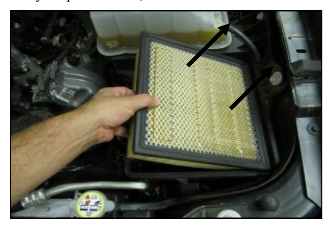
3. Remove the factory air filter from the lower half of the airbox.

B.) Unfasten the three airbox clips on the left side, and remove the upper half of the factory airbox.