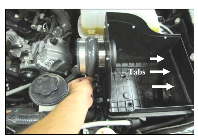
6. A.) Install the Silicone Hump Hose (#7) and two #64 Hose Clamps(#14) onto the Quick Fit assembly. Leave the clamps loose for now.

B.) Install the assembly onto the lower half of the factory airbox. Slide the metal tabs into the airbox slots, and fasten the 3 airbox clips.