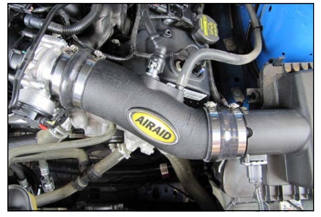
10. Slide the air box outlet into the Coupler. Connect the breather lines from step 2 to the Airaid Intake Tube. Rotate the tube if necessary to clear the Hood and valve cover and tighten all Clamps.