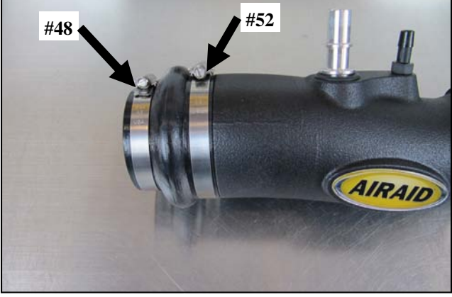
6. Slide the Hump Hose, one #48 Clamp, and one #52 Clamp onto the Intake Tube as shown. Do not tighten the Clamps at this time.

5. Manual transmission vehicles will not need the Barbed Fitting and will use the Threaded Plug.