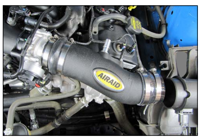
9. Slide the Tube assembly onto the throttle body.