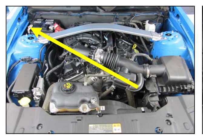
1. Disconnect the negative battery terminal.

Full color instructions can be viewed on our web site at Airaid.com. If you need any assistance please call 1-800-858-3333 to speak with a representative in our Customer Service Center before returning the product.