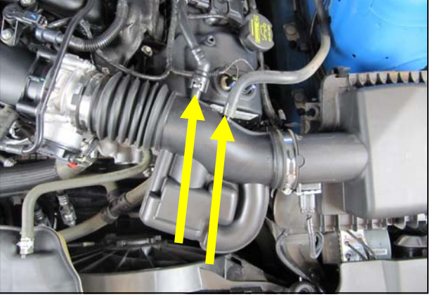
2. Carefully depress the connector lock tabs, and disconnect the crank case breather line and the brake aspirator line if equipped, (AT models only).