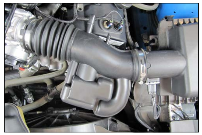
3. Loosen the hose clamps on the factory intake tube and remove it.