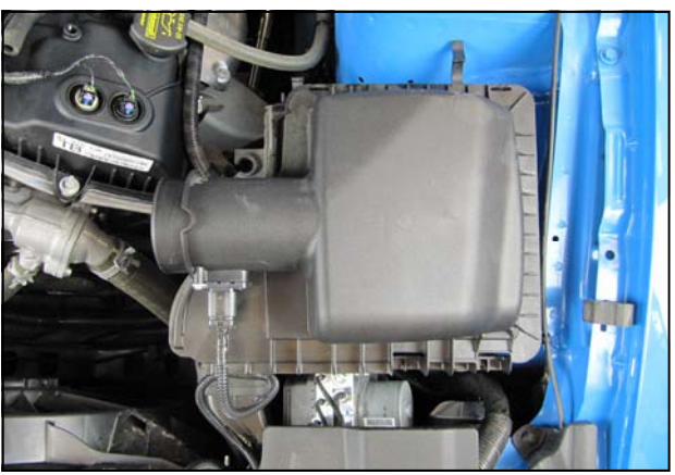
8. Unclip the factory air box lid and slide it off of the tabs in front. If you are installing an Airaid Jr. kit, install the Airaid Premium filter at this time. Leave the air box lid unattached for now.