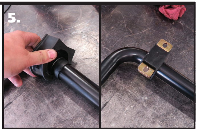
5. Open the SwayBar Bushing at the split and slide it OVER the Delrin Liner. Do this on both Delrin Liners. Next, slip the Bushing Straps over the SwayBar Bushings.