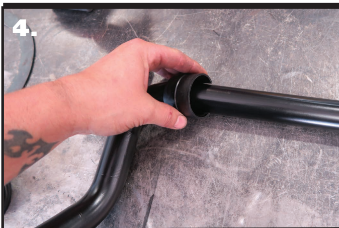
4. Open the Delrin Liner at the split and slip it over the SwayBar. Position it in the area that the bushing will ride based on the location of the stock swaybar. Do this on both ends of the swaybar.