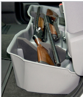
2 shotguns or rifles without scopes will fit in gun rack, as pictured above.

Warning: Seat bottom must be latched down at all times while vehicle is moving. Make sure the DU-HA is secured in the vehicle according to installation instructions. Do not store explosives or hazardous materials in the DU-HA. Do not place loaded guns in the DU-HA. For further instructions refer to truck owners manual or contact DU-HA, Inc.