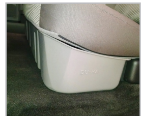
This is how the DU-HA should look installed under the back seat.