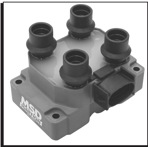
Figure 1 The MSD Ford 4- Tower Coil Pack.

WARNING: High Voltage is present on the coil terminals. DO NOT touch the coil terminals or tower when the engine is cranking or running.