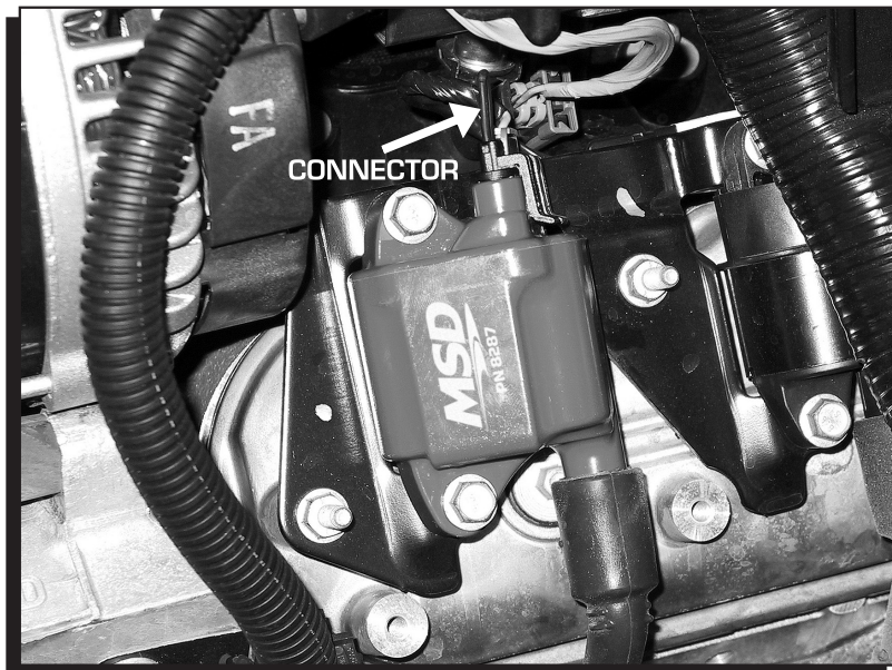
Figure 1 Coil Location and Connector

IMPORTANT: Notice that the MSD Coil has the connector installed (Figure 1). This 2-pin connector must be plugged in to the coil. If not, the coil will not operate.