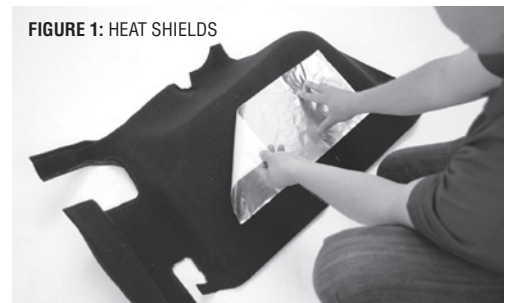
FIGURE 1: HEAT SHIELDS