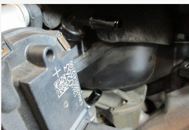
Remove factory PCV hose behind throttle body, now assemble oil separator kit as shown on front page. Make sure to hook up hose from the draw side of the oil separator to the intake manifold.