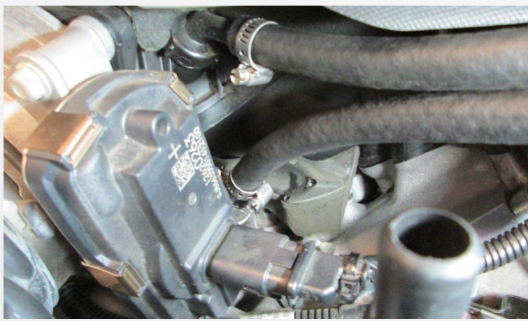
As shown in the picture the top hose is the draw side.