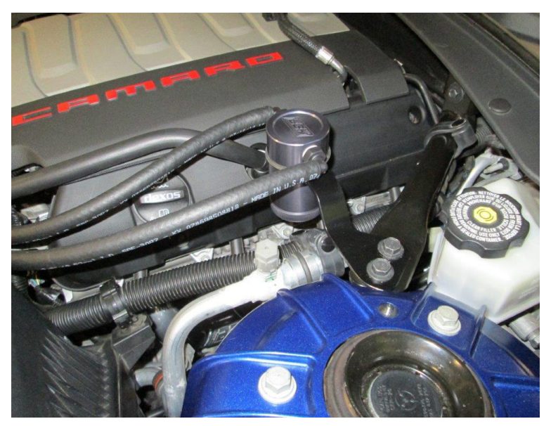
Remove factory strut tower bracket bolts then mount oil separator assembly, then run hoses forward and use supplied clamps at engine connection. Use 1/4 socket and ratchet to tighten clamps do not over tighten then use supplied zip tie for loose hoses as shown in picture.