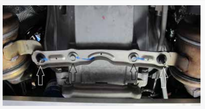
Loosen the (2) 13mm bolts and the (2) 13mm nuts on the cross brace. NOTE you do not need to remove it completely.