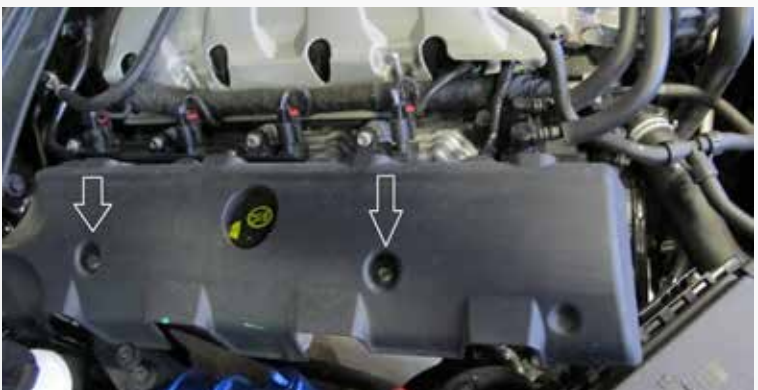
Remove the (2) torx bit bolts from the valve cover, disconnect the vent tube from the valve cover and the vacuum canister and remove the vacuum line and cover from the vehicle.