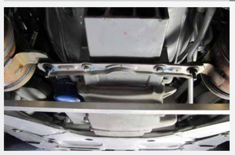
Tighten down the bolts on the cross brace. Reconnect the negative battery terminal after 500 miles of driving recheck and torque all hardware.