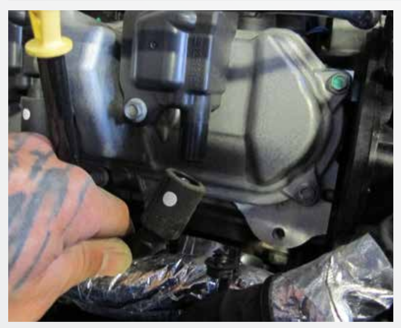
Remove the spark plug wires from the coil packs and the spark plugs.