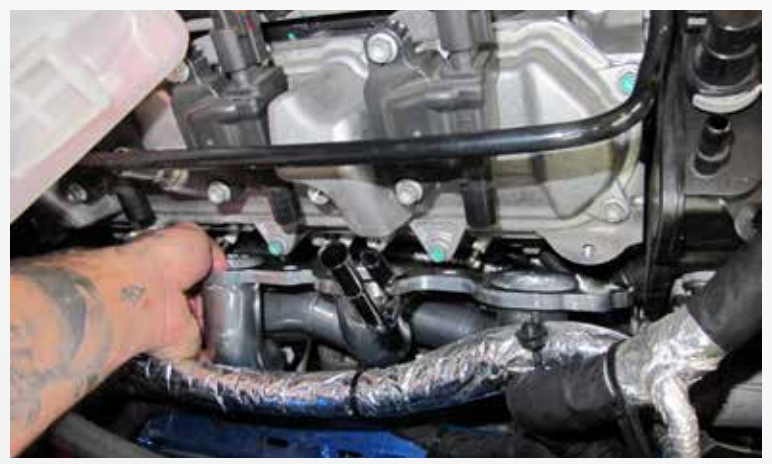
Install the BBK tune length header using the supplied gasket and hardware. NOTE the dipstick needs to be install at the same time by placing it through the header before putting it in.