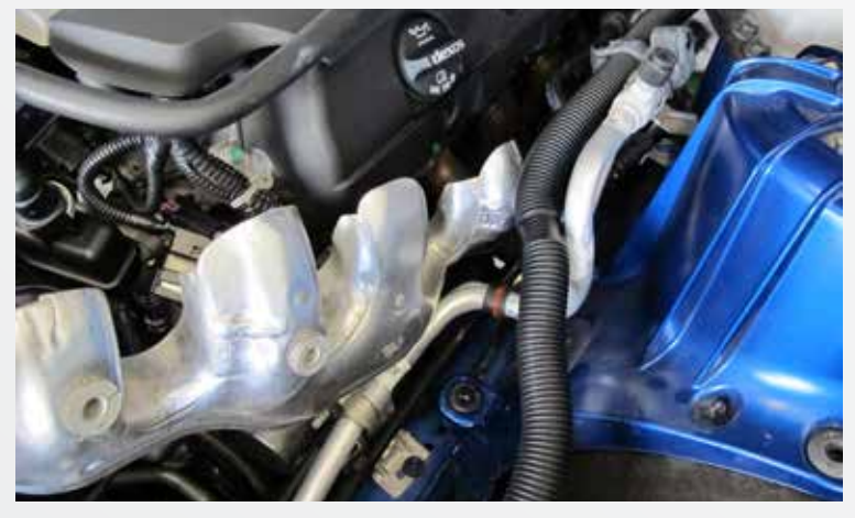
Passenger side remove the (3) bolts that hold the upper portion of the heat shield to the stock exhaust manifold and remove it from the vehicle.