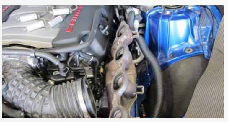
Remove the (5) bolts that secure the stock manifold to the cylinder head and remove the exhaust manifold and gasket from the vehicle.