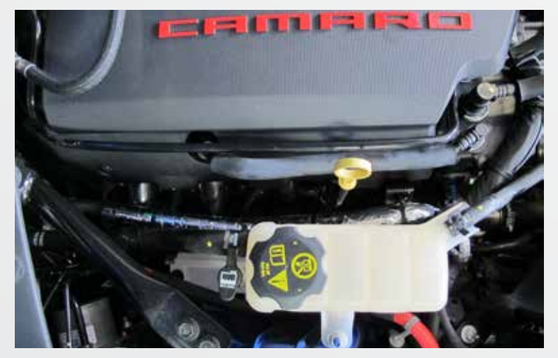
Connect the radiator hose to the reservoir, reinstall the wiring clip to the reservoir, install the valve cover, vacuum hose and engine cover.