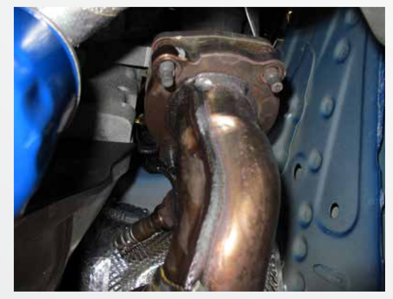
Remove the (4) 15mm nuts on the passenger side and driver side that secure the catted down pipe to the exhaust manifold.