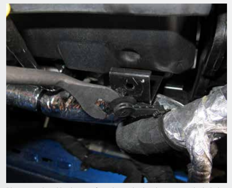
Disconnect the wiring harness from the engine bracket, remove the bolt that holds the wiring harness bracket in place and remove it from the vehicle.