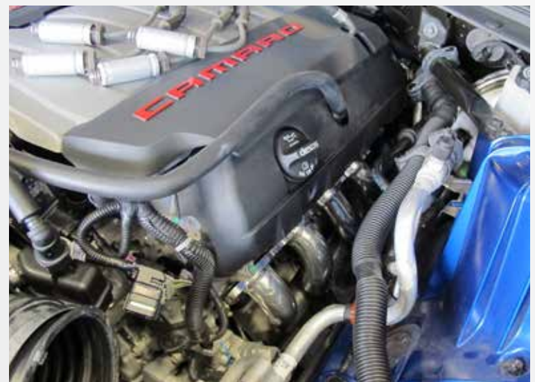
Install the BBK tune length header using the supplied gasket and hardware, tighten down the BBK tune length header bolts to the cylinder head first.

Remove the (4) spark plug wires from the coil packs and spark plugs.