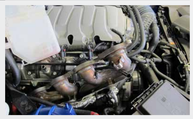
Remove the (5) bolts that secure the exhaust manifold to the cylinder head and remove it from the vehicle. NOTE the dip stick will come out with the exhaust manifold.