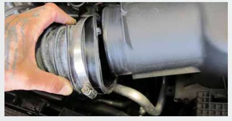
Loosen the clamp that secures the inlet tube to the factory air box, remove the air box by pulling it upwards releasing it from the rubber grommets and remove it from the vehicle.