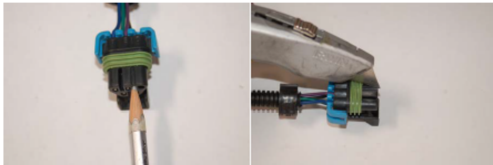
Open this slot up

On the male connector of the provided extension wires, the plastic needs to be trimmed out of the other slot as shown in the pictures. Use a sharp knife to carefully trim out the plastic to open the slot. Also make this modification to the O2 sensor plug.