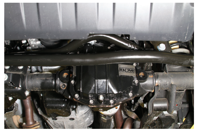
Congratulations, the installation of your B&M Front Differential Cover is now complete!

9. Refill differential fluid (specified by vehicle's manufacturer) to fill line. Check fluid level using dipstick. Once it has been filled, re-install dipstick.