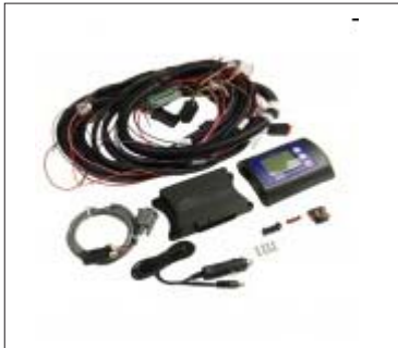
B&M Shift Plus 2 Transmission Controller #120001

NOTE: Complement your B&M TransKit with some of the following products. Check the B&M website at www.bmracing.com for various options: