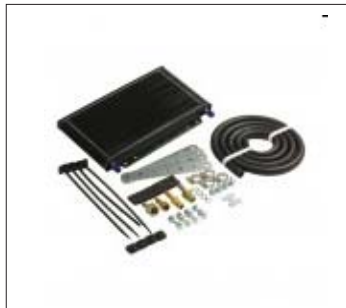
B&M Transmission Oil Cooler #70264 (SuperCooler) #70297 (Hi-Tek Cooler)