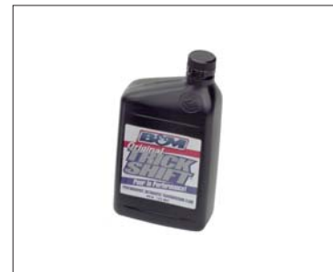
B&M Trick Shift TM #80259