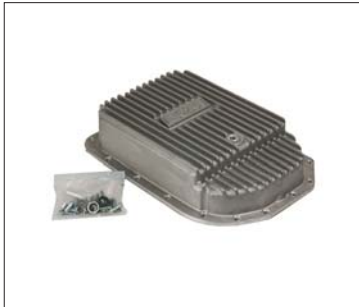
Cast Aluminum Deep Pan (Adds 3 qt.) #70295 For 4L80E 1993-1998