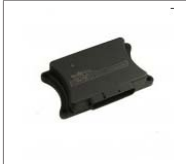
B&M Remote TPS (Must be used with #120001) #120002