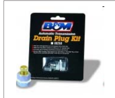
B&M Drain Plug Kit #80250