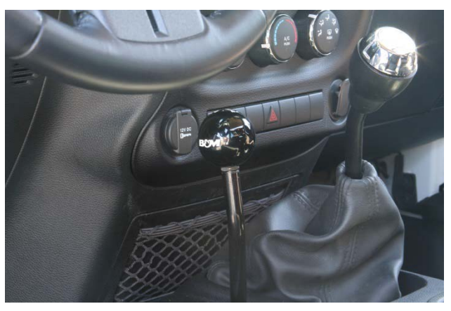
Congratulations, the installation of your B&M Transfer Case Shift Handle is now complete!