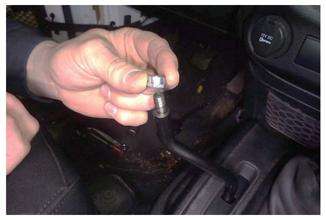
21. Install the jam nut (2) on the shift lever, with the wrench flats down. Run the nut all the way down to the shoulder.