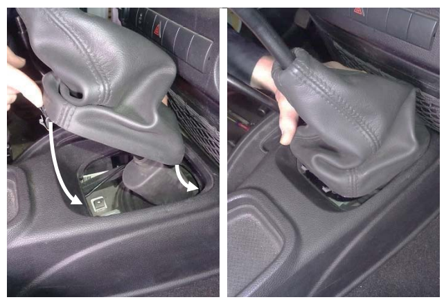
19. Slip the leather boot over the gearshift lever. Slip the 2 front hooks under the edge of the console cover, then press the 2 rear locking tabs into place.

16. Push the end of the transfer case shifter cable back onto its pin until you hear or feel it "click" in place, then verify the security of the connection. Verify smooth movement of the shift lever throughout its entire range.