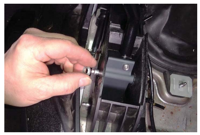
15. Push the retainer onto the tip of the pivot pin.