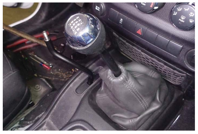
20. Press the gearshift knob onto the gearshift lever.