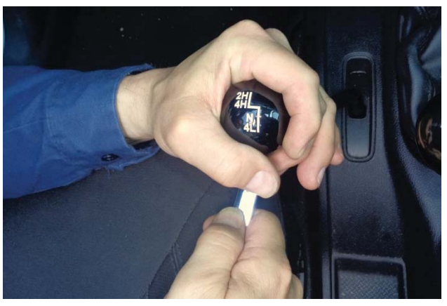
23. Tighten the jam nut against the knob.