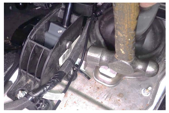
14. Seat the pivot pin by tapping gently.