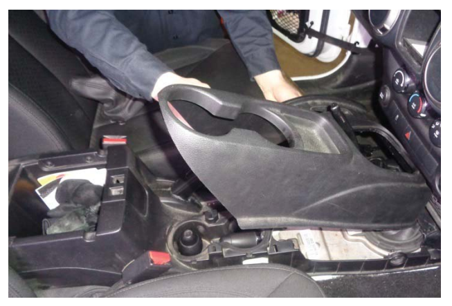
18. Open the center console storage lid, and carefully reinstall the center console cover.

17.Slip the dust cover over the shift lever, then press it onto the shifter base. Verify the security of all 4 locking tabs. Move the shift lever to the "4 High" position.