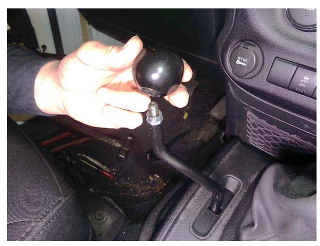
22. Install the shift knob (1) on the shift lever. Thread it on to the lever as far as possible with the shift pattern correctly oriented.