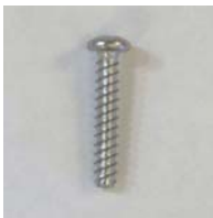
Plastite Screw (4 per)