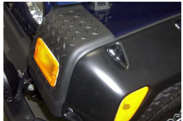
Photo #4 – Front Corner edge is under new Bushwacker Wiper-Style Edge Trim