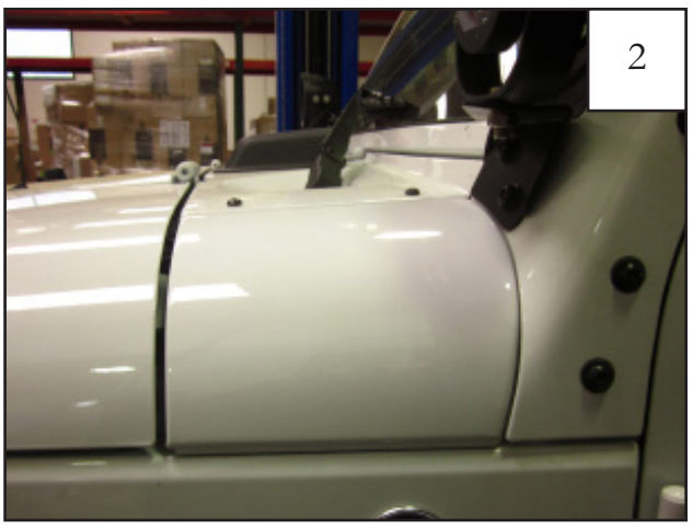
Using the supplied alcohol wipe, clean area where part will be placed. NOTE: Temperature should be between 60°F and 110°F for proper tape adhesion.