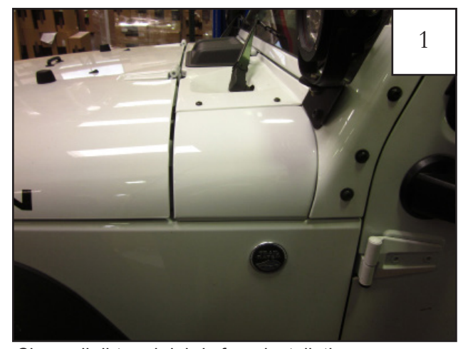
Clean all dirt and debris from installation area.