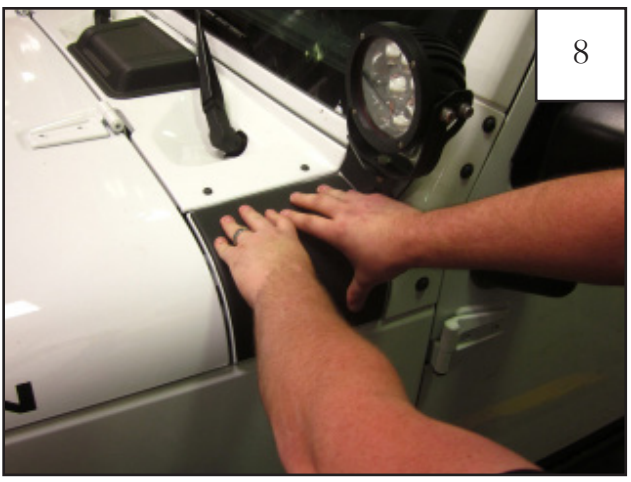
Apply 30 PSI for 30 seconds on each section of the part to ensure proper adhesion. NOTE: The tape reaches maximum adhesive bond after 24 hours of contact.