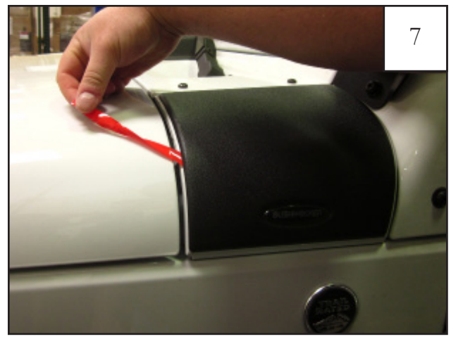
Pull liner located at the front toward the hood. Press down on entire length of part applying 30 PSI to the taped areas.