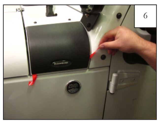
Pull liner located at the rear toward the door. Press down on entire length of part applying 30 PSI to the taped areas.