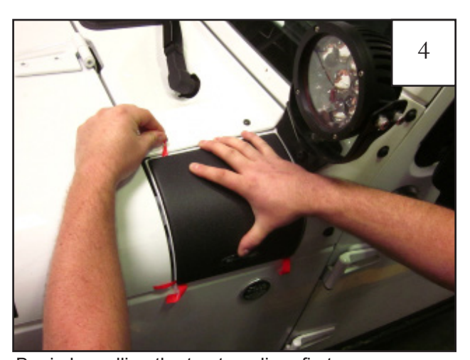
Begin by pulling the top tape liner first.