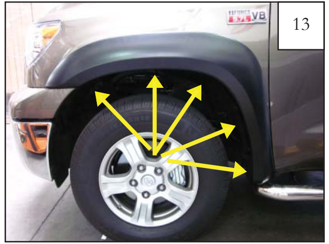
Ensure flare is properly positioned and tighten all screws.