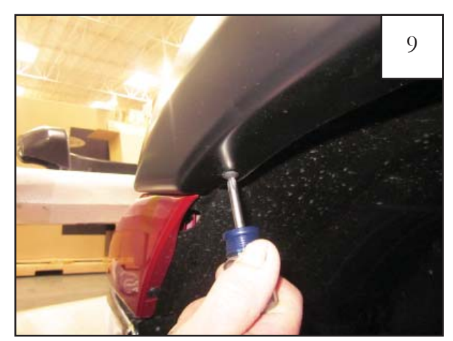
Align holes in flare with holes in Clips (CL1-0005). Start a supplied Screw (SW1-0050) through holes in flare and into each Clip (CL1-0005) installed in Step 11 in the order shown in Step 13. If necessary, use an awl to locate holes in clips .