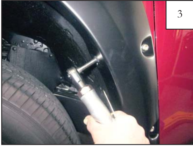
Start supplied Screw (SW1-0036) through top rear hole in flare and into factory hole in rear of wheel well. Do not tighten.