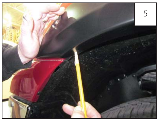
Hold front of the flare firmly on the fender. Mark three Clip (CL1-0005) locations using the holes in the flare as a guide.