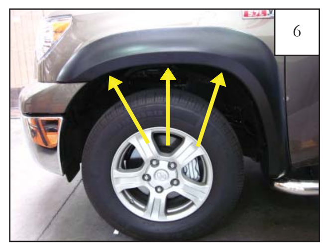
Three marked Clip (CL1-0005) locations.