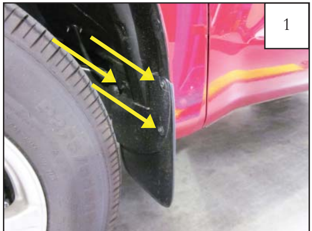
Remove three hex bolts from factory mud flap, using a 10mm socket.