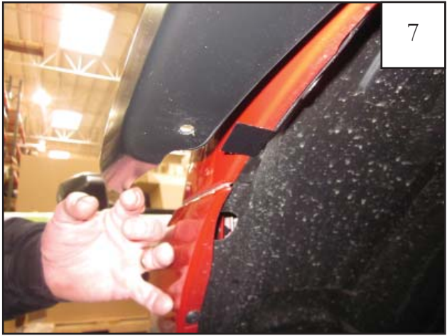
Pull flare outward to access the fender lip (with Screw [SW1-0036] still installed). Center a Tab (MT1-0002) over each mark made in Step 8.