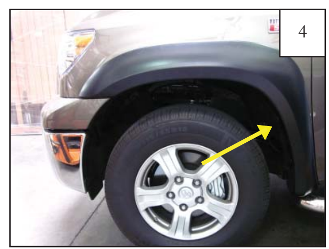
Screw (SW1-0036) location.