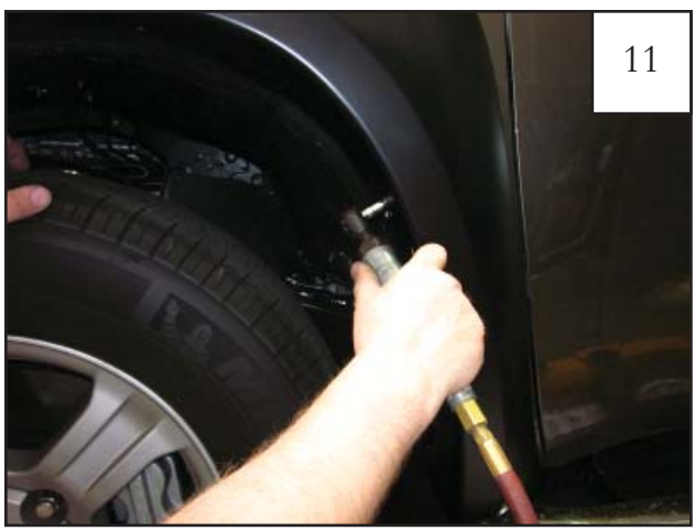
Start Screw (SW1-0036) through the one lower rear hole in flare and into factory hole in lower rear of wheel well