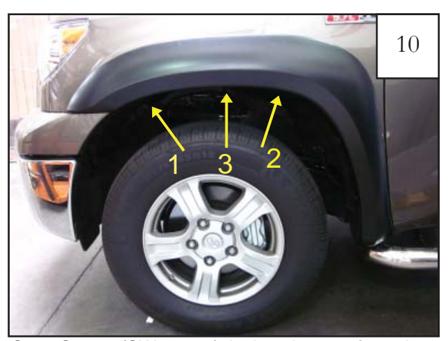
Start Screw (SW1-0050) in location #1 first, then move to #2, and start in location #3 last. DO NOT TIGHTEN.