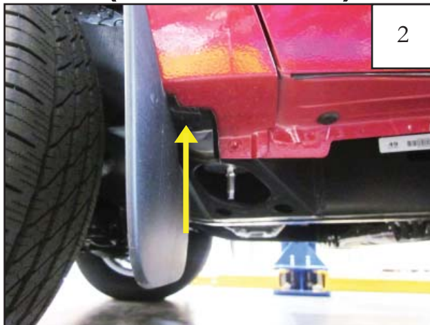
Remove one hex bolt from underside of mud flap using a 10mm socket. Discard mud flap