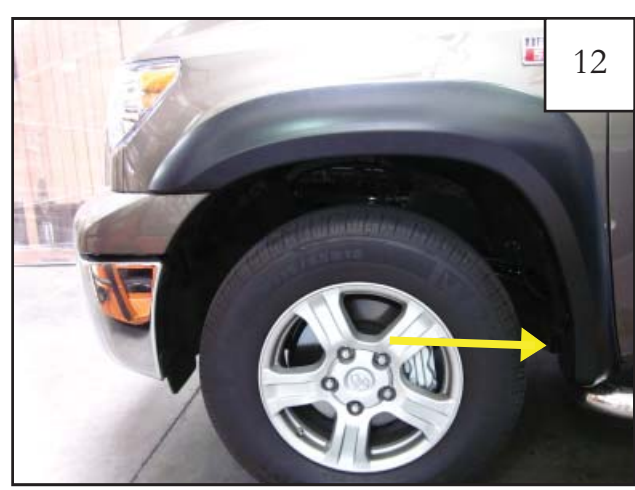
Screw (SW1-0036) lower rear wheel well location.