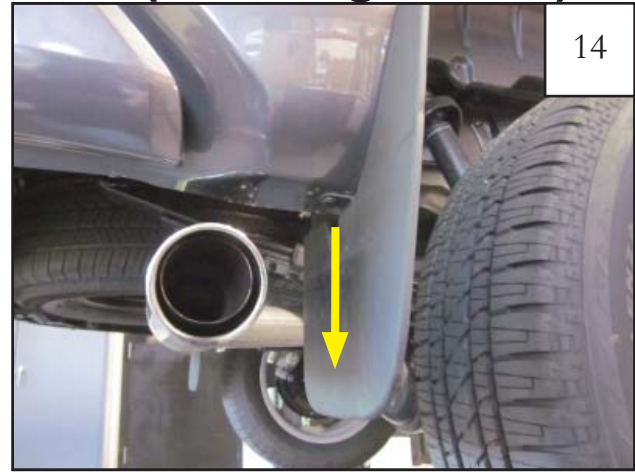
Remove push retainer from underside of factory mud guard and remove mud flap.