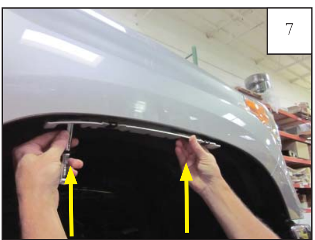
Using two supplied 20mm Hex Screws (SW1-0036), attach bracket to factory holes with a 10mm socket.