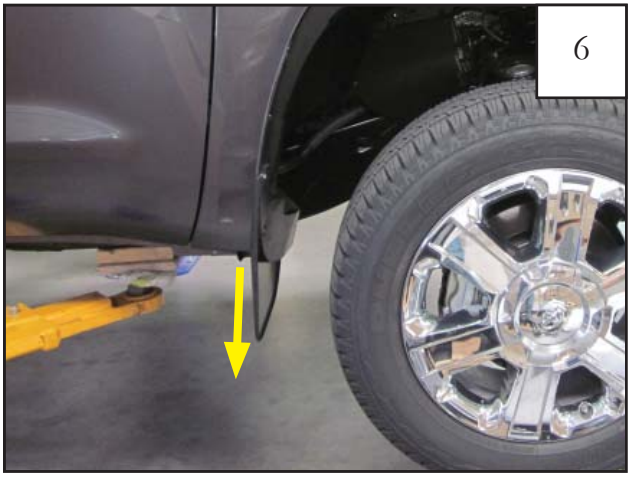
Remove push retainer from underside of factory mud guard. Remove Mud Guard from Vehicle.