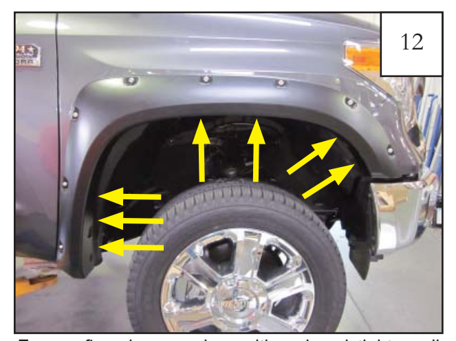
Ensure flare is properly positioned and tighten all screws. Installation Comlete. (See steps 5-7)