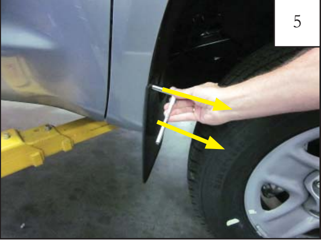
Using a 10mm socket, remove two factory screws from factory mud guard as shown.