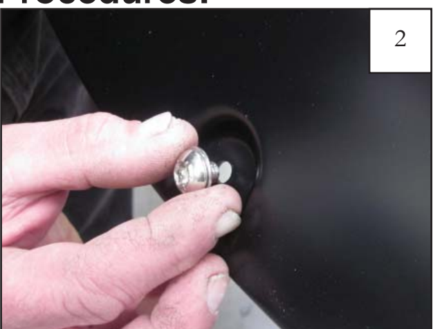
Put each Bolt/Washer combination through a pocket hole in the flare, Bolt head and Washer on the outside.