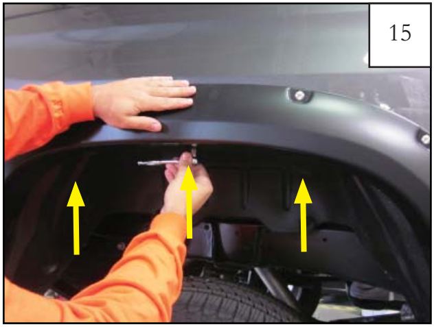
Hold the flare firmly on the fender. Start three supplied 20mm Hex Screws (SW1-0036) through the top center holes of the flare and into factory holes in fender.