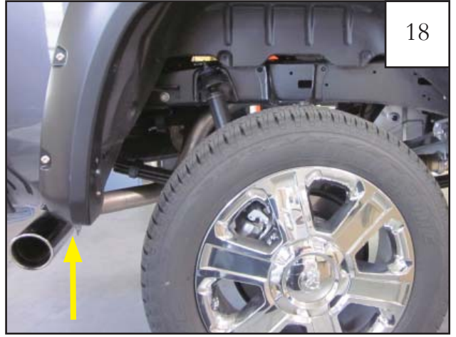
Install supplied Push Retainer (RV1-P009) into factory hole on underside of flare.