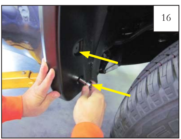
Start two supplied 20mm Hex Screws through the rearward most holes of flare and into the factory hole in fender.