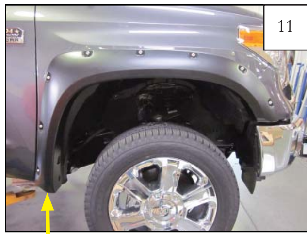
Install supplied push retainer (RV1-P009) into factory hole on underside of mudguard.