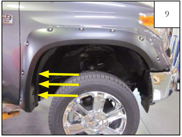
Start three supplied 20mm Hex Screws (SW1-0036) through three rear holes in flare and into factory holes in rear of wheel well.