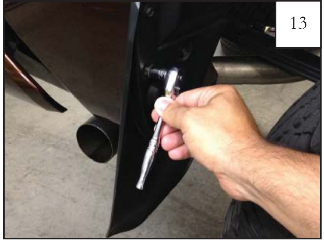
Using a socket wrench with a 10mm socket, factory screw second from the top of the mud guard.

Rear Flare Installation Procedures (Passenger Side):