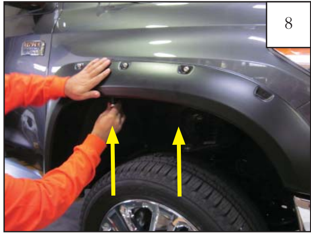
Place flare on fender, alighning holes with clips on the bracket. Start two supplied 20mm Hex Screws (SW1-0036) throught two holes on the top of the flare and into clips.