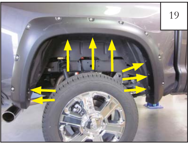
Ensure flare is properly positioned and tighten all screws. Installation complete (See steps 15-17).