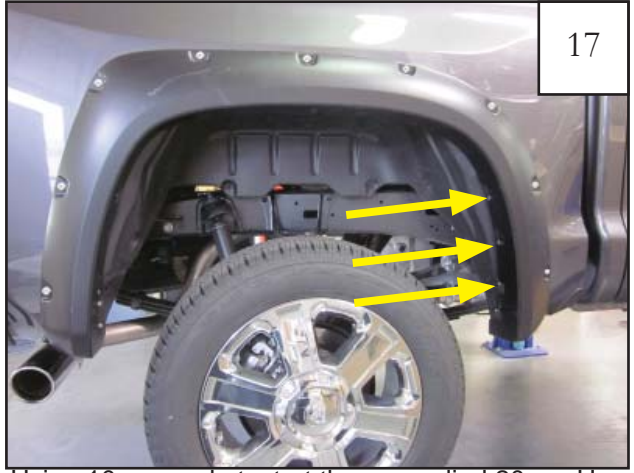
Using 10mm socket, start three supplied 20mm Hex Screws through the forward most holes of flare and into factory holes in fender.