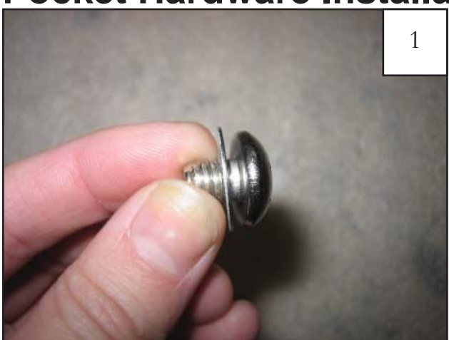
Put a Washer (WA1-0012) on each Bolt (SW1-0059).