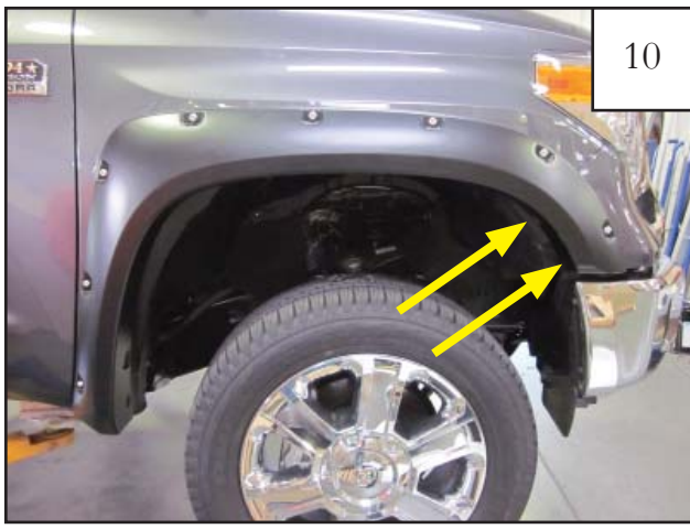
Start two supplied 20mm Hex Screws through forward most holes in flare and into factory hole locations.