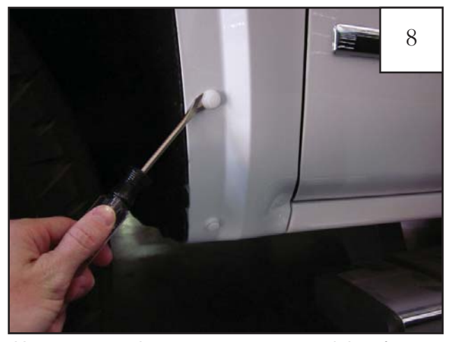
Use a pry tool to remove any remaining factory fasteners that may have stayed on the vehicle during the removal process.