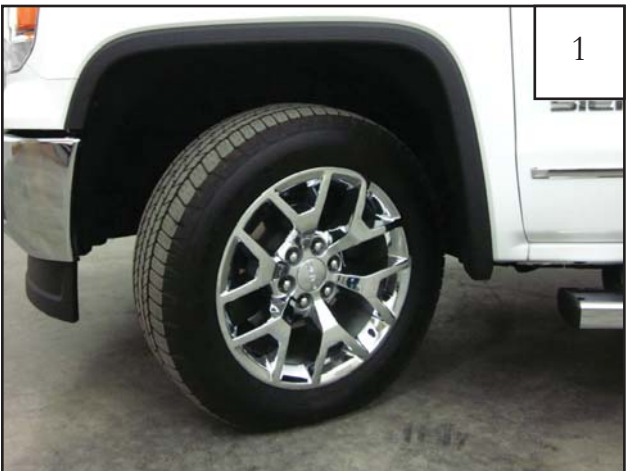
Turn front tire outward for easier installation. Factory wheel arch molding must be removed prior to part installation. See next steps.