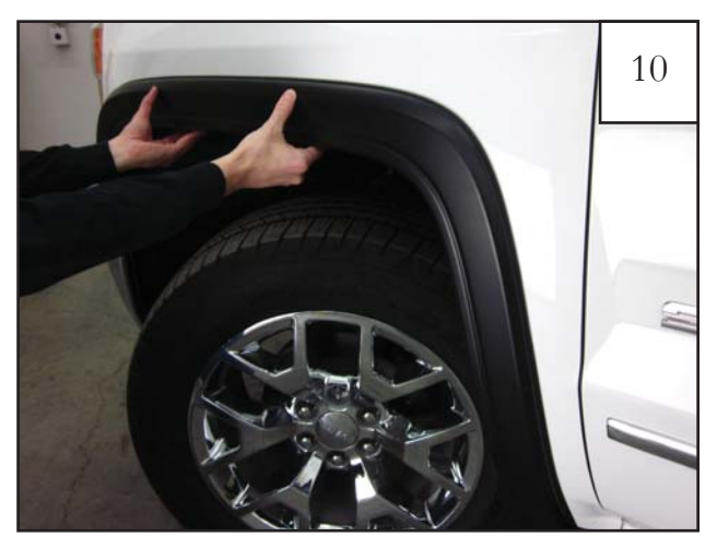
Hold Front Flare up to wheel well to confirm fit. Do not install fasteners at this time.