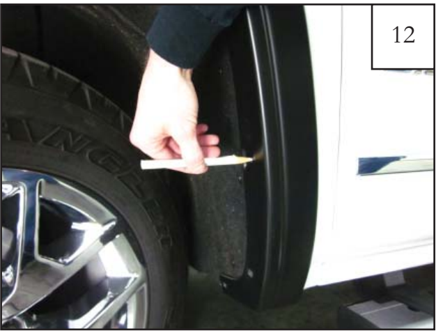
Using a grease pencil or marker, mark one hole location for drilling using the upper rear hole location in the flare as a guide. Note: This step not needed for models with factory installed mudflaps.