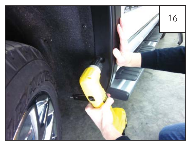
Install self-tapping screw (SW1-0066) into pilot hole drilled in step 13. Press flare towards vehicle while fully tightening. Note: This step not needed for models with factory installed mudflaps.