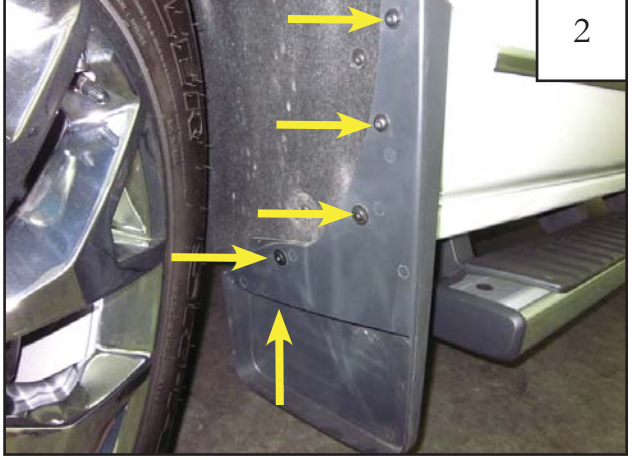
FOR MODELS WITH FACTORY MUDFLAP: Remove mud flap fasteners. Use T-30 Torx bit for two upper fasteners. Use T-15 Torx Bit for two lower fasteners and use a Phillips Head Screwdriver for Bottom fastener.