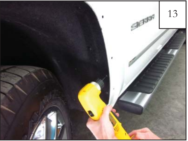
Remove the flare. Using a 3/32" drill bit, drill a pilot hole through the factory wheel well liner and sheet metal at location marked in previous step.