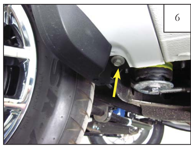
Remove fastener from rear underside of factory wheel arch molding using a 1/2" socket and wrench. Save for reinstallation.