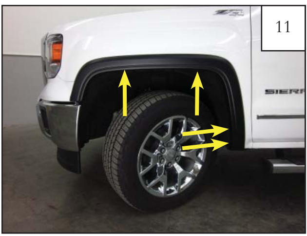
While holding Flare on vehicle, install supplied screw (SW1-0056) into the four factory hole locations as shown. Do not fully tighten at this time.