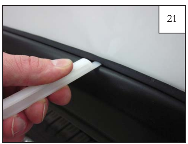
Using flat end of supplied Edge Trim Tool (ET1-0002), seat edge trim against flare by inserting straight end between edge trim and flare at one end. Next, slide around entire edge to the other end.