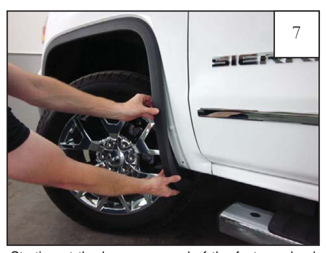
Starting at the lower rear end of the factory wheel arch molding, firmly grip part and pull to remove from vehicle. Note: You will hear popping sounds as the factory fasteners release from vehicle. This is normal.