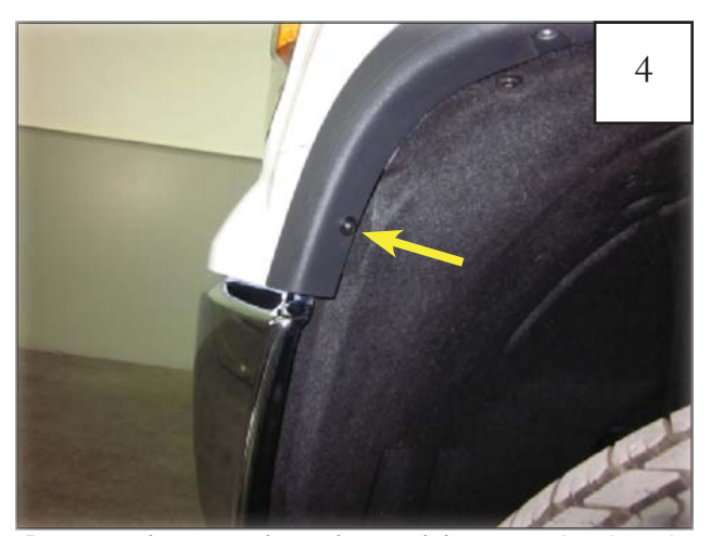
Remove fastener from front of factory wheel arch molding using a 9/32" or 7mm socket and wrench. Save for reinstallation.