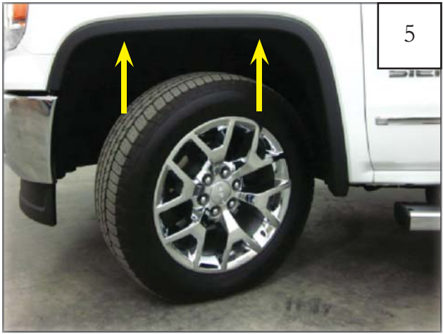
Remove two fasterners along top of factory wheel arch molding using a T-15 Torx bit.