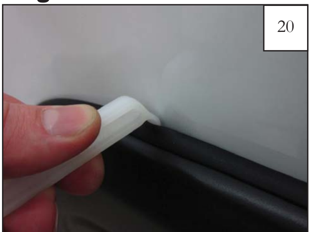
Using supplied Edge Trim Tool (ET1-0002), seat edge trim against vehicle by hooking curved end under edge trim at one end of flare. Next, slide around outer edge of flare to the other end.