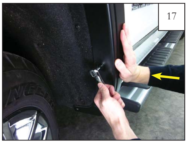
FOR MODELS WITH FACTORY MUDFLAP: Reinstall factory fastener removed from mudflap in step 2. Press flare towards vehicle while fully tightening using a T-30 Torx Bit.