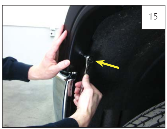
While holding Flare on vehicle, install factory screw removed in Step 4 through flare and into factory hole. Do not fully tighten at this time.