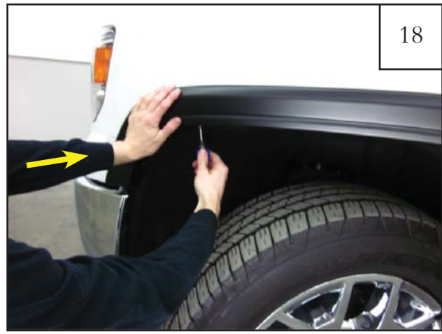
Press flare towards vehicle and fully tighten all remaining fasteners.