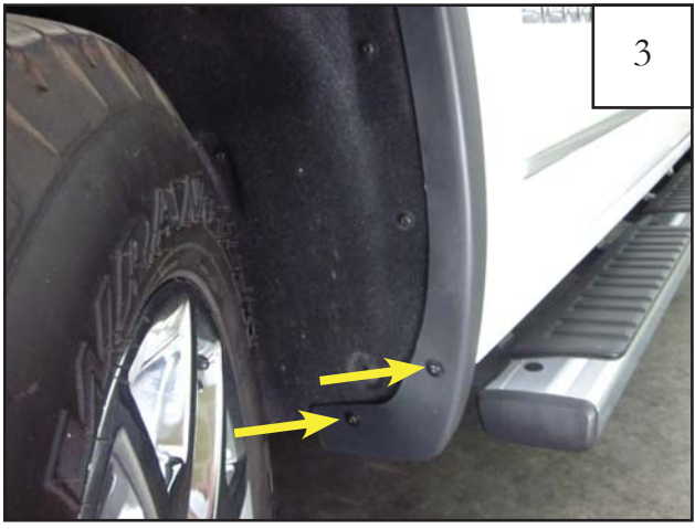
Remove two lower fasterners from factory wheel arch molding using a T-15 Torx Bit.