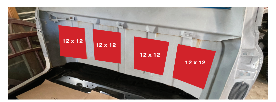
FIG. 3 Rear Bulkhead Install damping matertial in these approximate locations. The perfect placement is not critical. But good adhesion is key. Make sure to press material in place with roller to ensure good adhesion. (View from driver side door)