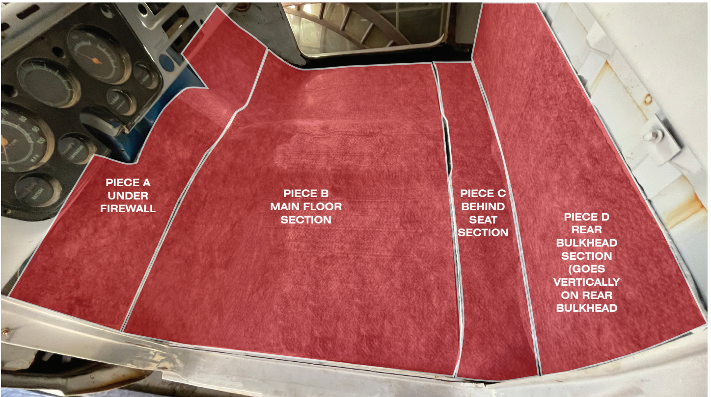
FIG. 2 Test fit all pieces in place. Mark & cut all mounting holes needed (View from driver side)