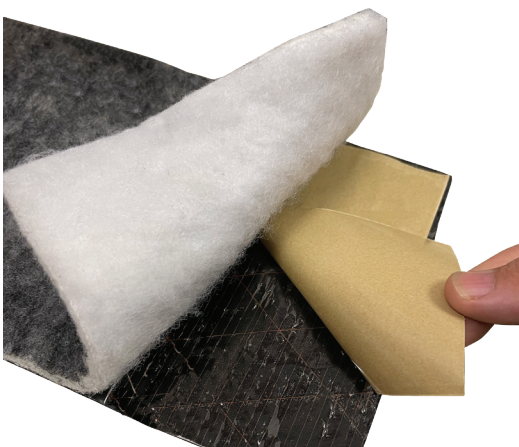
FIG. 4 Install strips of adhesive Transfer Tape to the floor pan where needed to hold Under Carpet Lite insulation in place. The placement is not critical. Just apply to areas to hold insulation in place. Once applied, peel back liner of tape and press Under Carpet Lite Insulation in place.