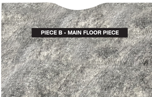
PIECE B - MAIN FLOOR PIECE