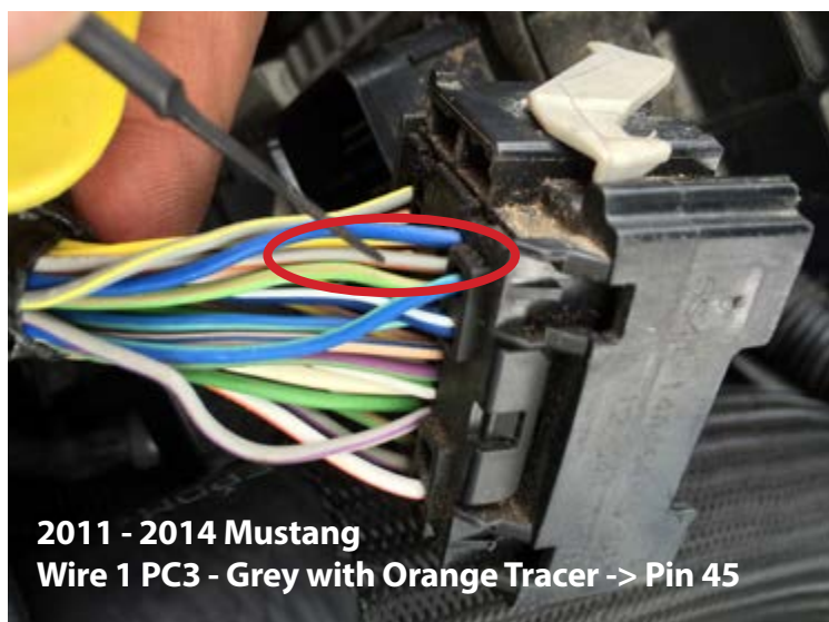
2011 - 2014 Mustang Wire 1 PC3 - Grey with Orange Tracer -> Pin 45