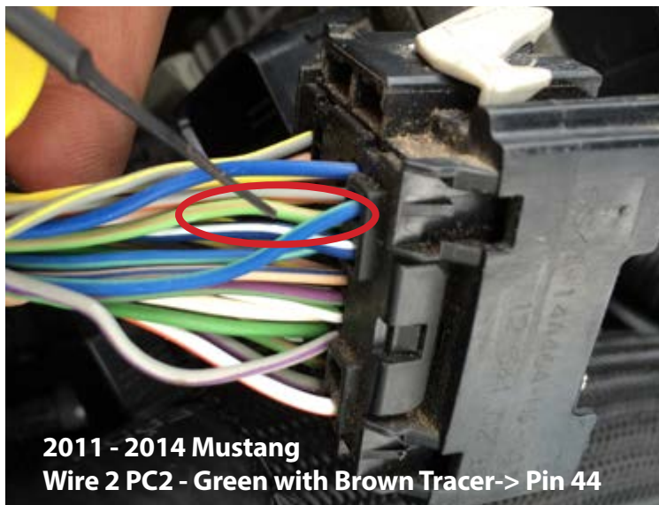
2011 - 2014 Mustang Wire 2 PC2 - Green with Brown Tracer-> Pin 44