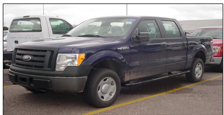
SIDE BAR INSTALLED.

Cleaning and care instructions: Design : Quality: