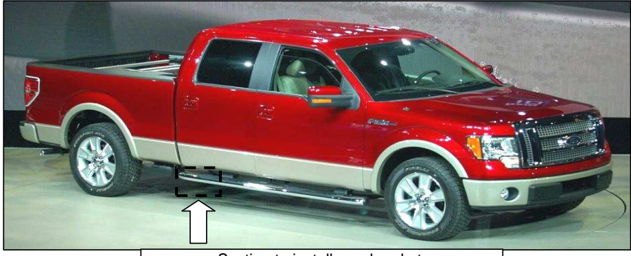
Section to install rear bracket.