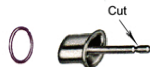
359 Push Button

These Push Rod will work with all handles. The Push Rod may need to be trimmed to fit on the handles that attach to the a lever.