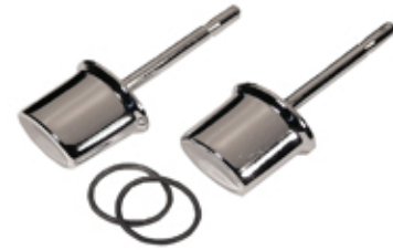
359 Push Buttons

359 - push buttons are sold in pairs work with both 794 and 794A handles. (may require cutting rod)