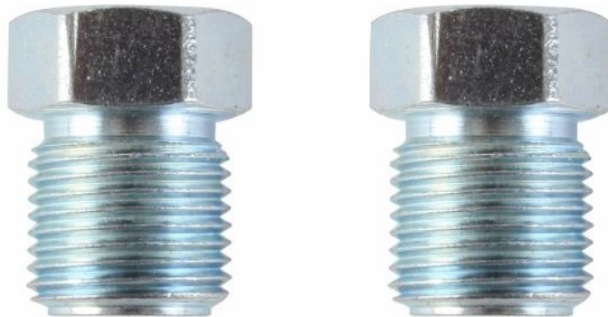
Figure 2 - Brake Master Cylinder Fittings