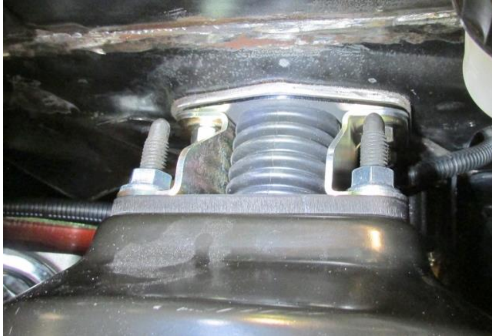
Figure 1 - Install Brake Booster/Master Cylinder to Firewall