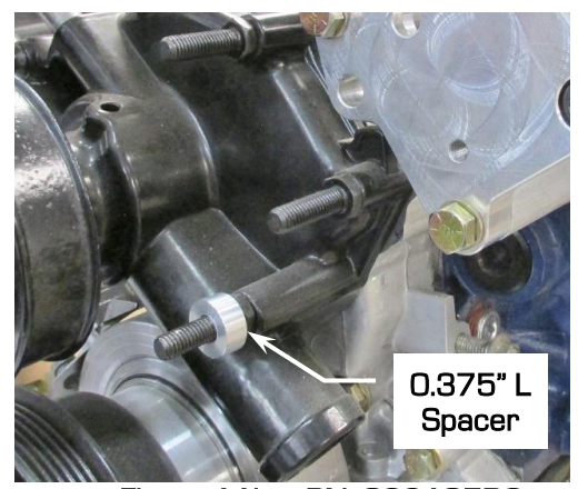
Figure 11b - PN: 092105DS

10.Attach the pump and bracket to the mount by lining up the bracket holes with the front cover studs. Thread the two 5/16"-18 hex bolts into the tapped holes on the mount (Figure 12). Use medium strength blue Loctite 242 on the threads and torque to 19 ft-lbs.