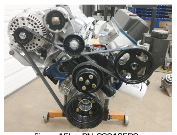
Figure 15b - PN: 092105DS

If you have any questions before or during the installation of this product, please contact Detroit Speed at <u>tech@detroitspeed.com</u> or 704.662.3272