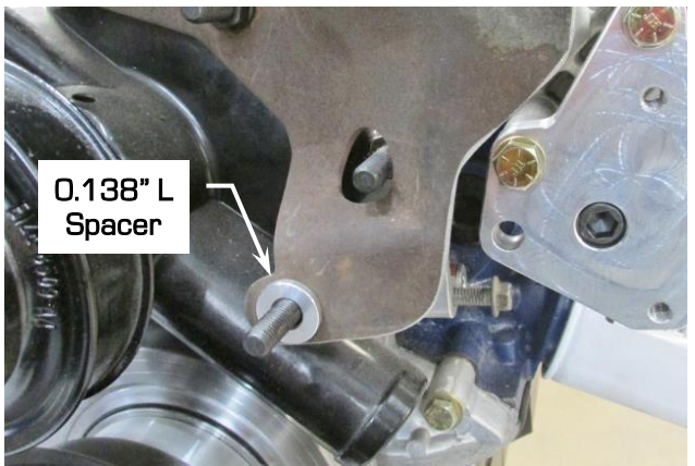
Figure 11a - PN: 092104DS

9. For A/C applications, place the provided 0.138" L aluminum spacer in front of the A/C bracket on the lower front cover stud (Figure 11a). For non-A/C applications, place the provided 0.375" L aluminum spacer on the lower front cover stud (Figure 11b).