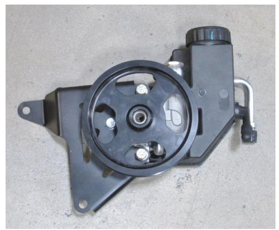
Figure 10b - PN: 092105DS

9. For A/C applications, place the provided 0.138" L aluminum spacer in front of the A/C bracket on the lower front cover stud (Figure 11a). For non-A/C applications, place the provided 0.375" L aluminum spacer on the lower front cover stud (Figure 11b).