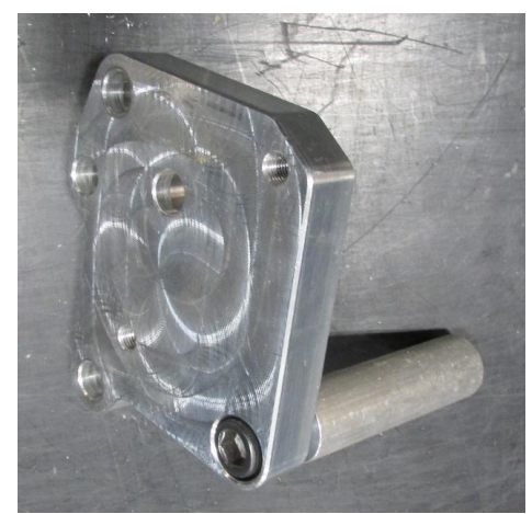
Figure 6 - Install Socket Head Bolt & Spacer

6. Install the two provided 7/16"-14 x 5" L hex head bolts with 7/16" AN washer through two of the holes in the pump mount (Figure 7). Place the other two 3.103" L aluminum spacers over the exposed threads of the bolts (Figure 8).