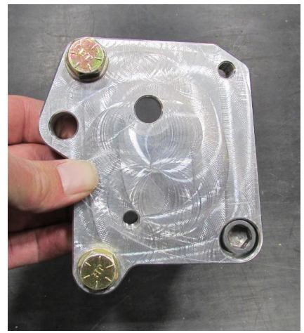
Figure 7 - Install 7/16" Bolts

6. Install the two provided 7/16"-14 x 5" L hex head bolts with 7/16" AN washer through two of the holes in the pump mount (Figure 7). Place the other two 3.103" L aluminum spacers over the exposed threads of the bolts (Figure 8).