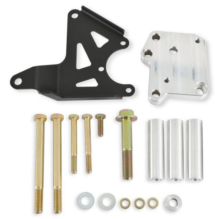
Figure 1 - PN: 092105DS (without A/C)

The Detroit Speed Power Steering Pump Bracket allows simple installation of DSE's GM Type II power steering pump onto Ford small block engines. The mount is CNC machined from 6061 billet aluminum and includes all hardware to attach the pump and powder coated steel bracket to your engine. Detroit Speed offers kits for Ford engines with and without A/C.