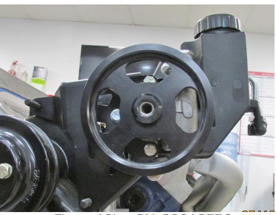
Figure 12b - PN: 092105DS