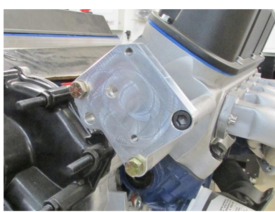
Figure 9b - P/N: 092105DS