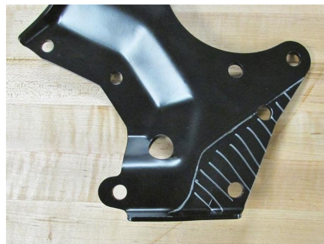
Figure 2 - Draw Cut Line

3. Place the provided 7/16"- 14 \times 1-1/2 " L socket head bolt through the counter-bored hole located in the center of the pump mount. Place the provided 1.119" L aluminum spacer over the exposed threads of the bolt (Figure 3).