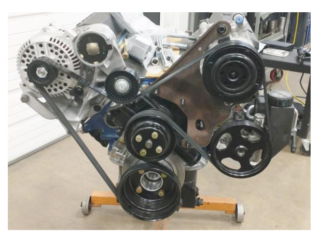
Figure 15a - PN: 092104DS

12. Install the power steering pump belt and adjust the tension (Figure 15).