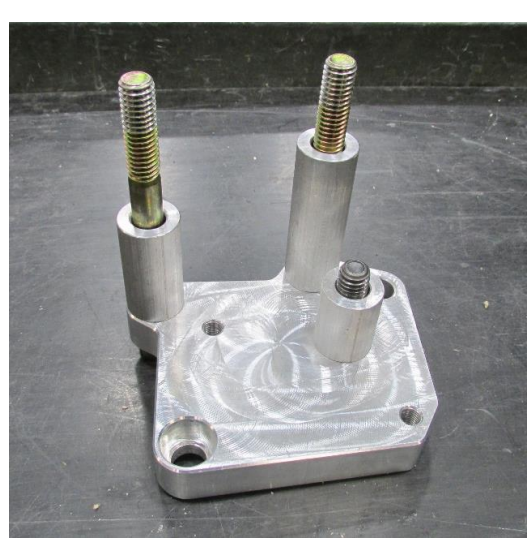
Figure 5 - Install Spacers