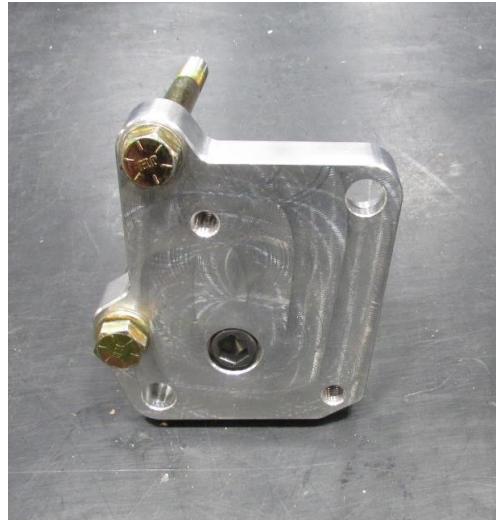
Figure 4 - Install 7/16" Bolts

4. Install the two provided 7/16"- 14 \times 5 " L hex head bolts with 7/16" AN washers through two of the holes in the pump mount (Figure 4). Place the 1.663" L aluminum spacer of the threads of the top bolt and the 2.487" L aluminum spacer of the threads of the bottom bolt (Figure 5). Skip to Step 7.