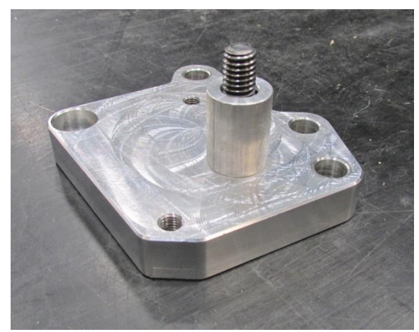
Figure 3 - Install Socket Head Bolt & Spacer

4. Install the two provided 7/16"- 14 \times 5 " L hex head bolts with 7/16" AN washers through two of the holes in the pump mount (Figure 4). Place the 1.663" L aluminum spacer of the threads of the top bolt and the 2.487" L aluminum spacer of the threads of the bottom bolt (Figure 5). Skip to Step 7.