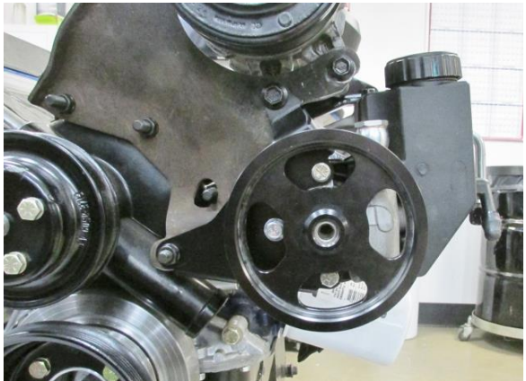
Figure 12a - PN: 092104DS

10.Attach the pump and bracket to the mount by lining up the bracket holes with the front cover studs. Thread the two 5/16"-18 hex bolts into the tapped holes on the mount (Figure 12). Use medium strength blue Loctite 242 on the threads and torque to 19 ft-lbs.