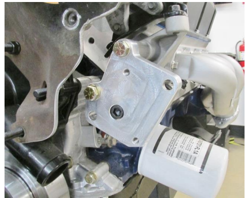
Figure 9a - PN: 092104DS

7. Attach the mount by threading the bolts into the tapped accessory holes on the driver's side cylinder head/front drive bracket (Figure 9). Use medium strength blue Loctite 242 on the threads of the bolts. Torque the socket head bolt to 25 ft-lbs. Torque the hex head bolts to 35 ft-lbs.