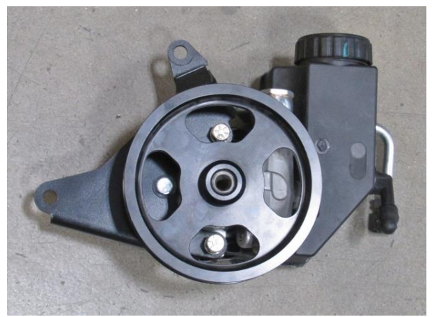
Figure 10a - PN: 092104DS

8. Place the provided powder coated bracket on the front side of the pump. Install the provided 5/16"-18 hex head bolts and 5/16" AN washers through the top and bottom holes in the bracket and the pump. Thread the provided M8-1.25 x 25mm hex bolt through the side hole in the bracket and into the pump (Figure 10). Use medium strength blue Loctite 242 on the threads of the M8 bolt and torque to 19 ft-lbs.