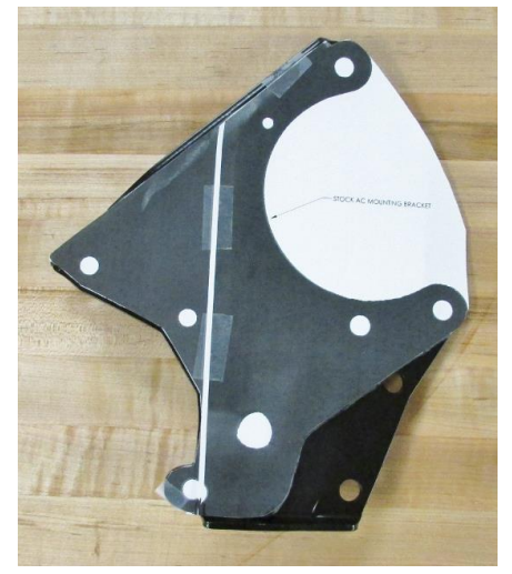
Figure 1 - Cut Out Template

2. Draw a cut line onto the A/C bracket using the template (Figure 2 on the next page). Remove the template from the bracket and remove this section of the bracket. Grind smooth for a clean finish. Re-install the bracket back onto the engine.