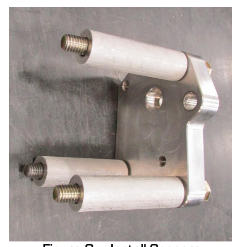
Figure 8 - Install Spacers

7. Attach the mount by threading the bolts into the tapped accessory holes on the driver's side cylinder head/front drive bracket (Figure 9). Use medium strength blue Loctite 242 on the threads of the bolts. Torque the socket head bolt to 25 ft-lbs. Torque the hex head bolts to 35 ft-lbs.