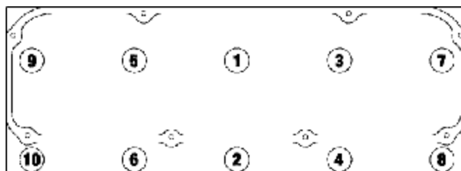
(EXHAUST PORT SIDE)