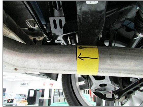
Figure 2 (Passenger's) Right Side