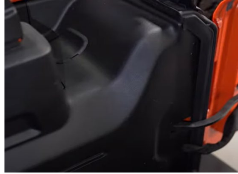
11. Reinstall plastic cover.