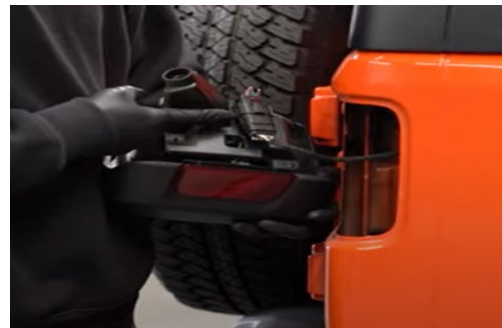
4. Disconnect wire harness clip.