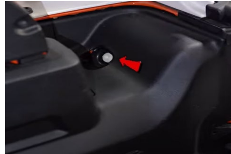
2. Remove 10mm tail light retainer.