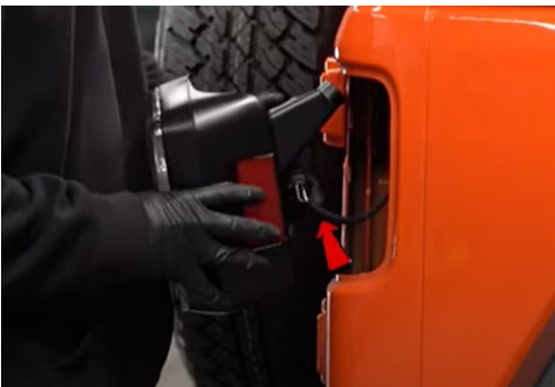
8. Connect wire harness.