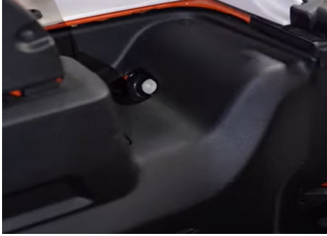
10. Reinstall 10mm tail light retainer.