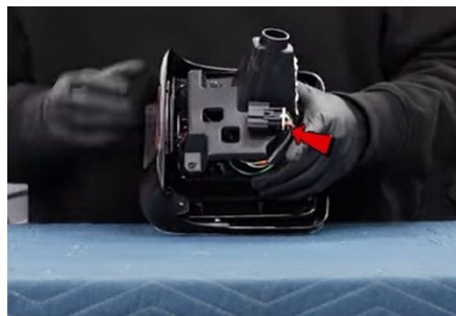
8. Clip Spyder wire harness connector onto bracket.