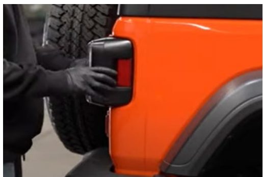
9. Seat Spyder tail light.