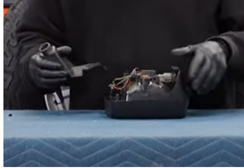
6. Carefully remove bracket from tail light.