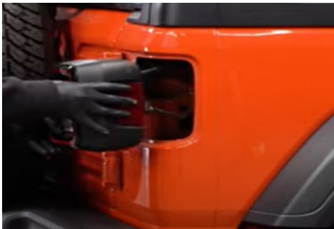
3. Unseat tail light.