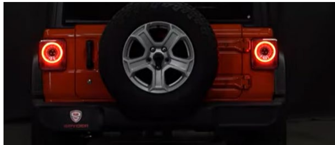
12. Turn on lights and confirm all functions are working properly. You have successfully completed the install of your new Spyder LED tail lights.