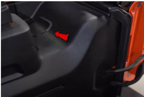
1. Remove plastic cover using panel popper.