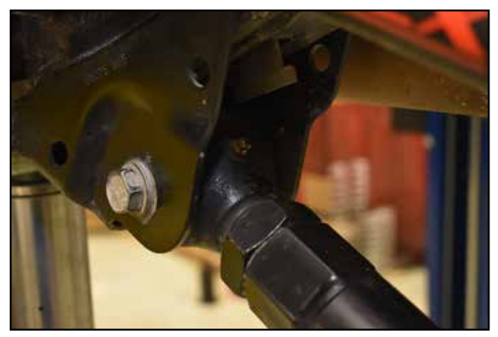
HINT: If mounting bolt is difficult to install due to misalignment of the control arm bushing with mounting bracket, either (1) adjust height of axle housing with hydraulic jack.

O Mount the control arm to the frame bracket with the grease fitting up. Install the original mounting bolt and flag nut. Finger tighten the bolt. DO NOT torque mounting hardware until instructed.