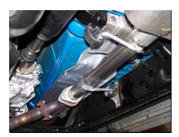
2. Install head pipe #A onto your existing stock front pipe and attach with hardware kit #F. DO NOT TIGHTEN. Insert welded hangers into rubber grommets.

4. Install the overaxle tailpipe #C into the muffler 1½-2" secure with clamp #E. DO NOT TIGHTEN. Insert welded hanger into rubber grommet.