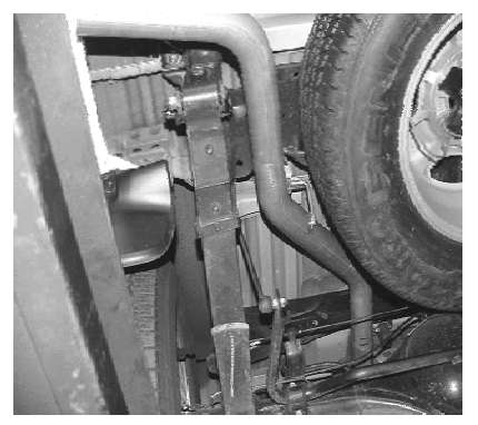
SLIP THE OVER AXLE TAILPIPE #C INTO THE OUTLET OF THE MUFFLER 1" TO 2". CONNECT REAR HANGER WITH FACTORY BOLT. HANGER #I ON THE MUFFLER OUTLET. DO NOT TIGHTEN.

REMOVE THE STOCK EXHAUST BY UNBOLTING THE 17MM BOLTS IN FRONT OF THE MUFFLER. UN-BOLT FACTORY HEADPIPE (YOU WILL RE-USE YOUR FLANGE BOLTS). DO NOT DAMAGE THE FACTORY GASKET YOU WILL NEED TO RE-USE! THEN CUT DIRECTLY BEHIND THE MUFFLER AND REMOVE THE STOCK EXHAUST.