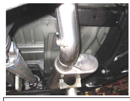
4. Install over axle pipe Item # C into the muffler outlet. Slip the hangers into the rubber grommets and keep tailpipe loose use clamp #E to secure together.