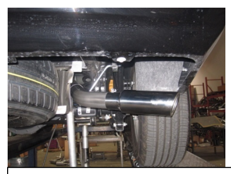
7. Be sure to check all clearance after each section has been tightened to be sure there is proper clearance. It may take 4-500 miles for your vehicle to fully adjust to the changes in exhaust flow.

"MAKE SURE YOU HAVE A 1" CLEARANCE ON ALL PIPES FROM ALL RUBBER BRAKE LINES, SHOCK BOOTS, TIRES, ETC..." TORQUE ALL CLAMPS TO APPROX. 100 TO 150 FT LBS.