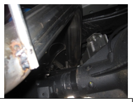
5. With everything loose you may need to adjust the system for proper clearance of shocks, brake lines, ect.