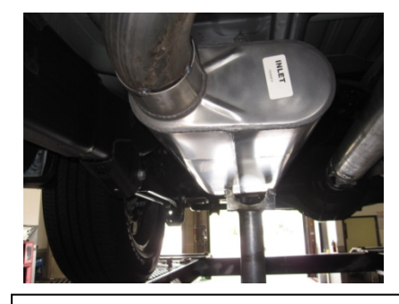
3. Install muffler #B onto headpipe 1.5" to 2" muffler should be level use clamp #E to secure together do not tighten.