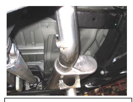
4. Install over axle pipe Item # C into the muffler outlet. Slip the hangers into the rubber grommets and keep tailpipe loose use clamp #E to secure together.