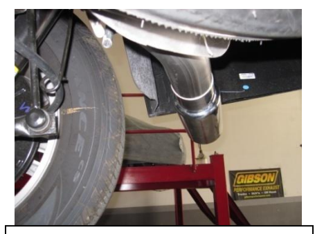
6. With proper clearance from spare tire install the exhaust tip onto the tailpipe. The system was designed to have the tip 1" below the quarter panel of the vehicle. With the tip in your desired position begin to tighten down all clamp connections from the