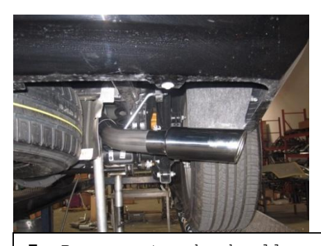
7. Be sure to check all clearance after each section has been tightened to be sure there is proper clearance. It may take 4-500 miles for your vehicle to fully adjust to the changes in exhaust flow.

"MAKE SURE YOU HAVE A 1" CLEARANCE ON ALL PIPES FROM ALL RUBBER BRAKE LINES, SHOCK BOOTS, TIRES, ETC..." TORQUE ALL CLAMPS TO APPROX. 100 TO 150 FT LBS.