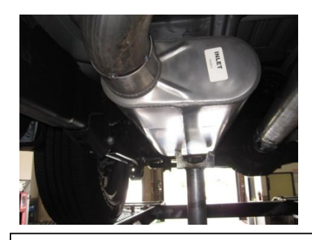
3. Install muffler #B onto headpipe 1.5" to 2" muffler should be level use clamp #E to secure together do not tighten.