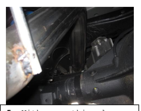
5. With everything loose you may need to adjust the system for proper clearance of shocks, brake lines, ect.