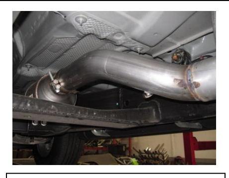
1.Install headpipe #A onto your factory pipe using your stock clamp insert welded hanger into the rubber grommet leave clamp loose.

1. Disconnect the negative battery cable before removal of the OEM Exhaust. This will allow the computer to reset and recognize the new exhaust. Lay out the exhaust on the floor so it looks like the drawing and compare parts with manual. Remove the factory exhaust by cutting behind the factory muffler. Once the tail pipe has been removed un-bolt the muffler and head pipe at the clamp located in front of the factory muffler. Use wd-40 or another type of penetrating oil to remove the rubber grommets. Do not damage these they will be re used.